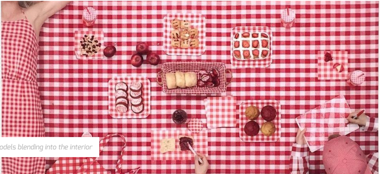
Models blending into the interior