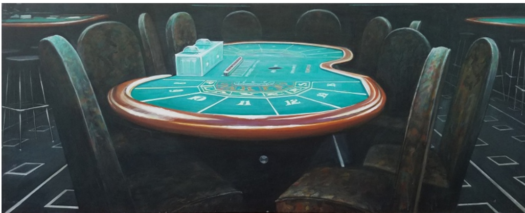
Peter Waite – Casino Bahamas, 1996

Peter Waite art pieces have an unusual eerie glamour that's at the same time incredibly appealing and utterly repulsive. He paints large-scale images of places where people go unwillingly, like operating rooms, offices or prison cells . By realistically painting these sites without the presence of humans or emotions of any kind, Peter Waite also portrays the emptiness of today's postindustrial life. EBK gallery in Hartford in Connecticut is hosting Peter Waite's celebrated mid-1990s series that portrays spaces that require a permission to enter. Solo show entitled it's like déjà vu all over again consists of 19 paintings originally presented at Edward Thorp Gallery space in New York in 1996.