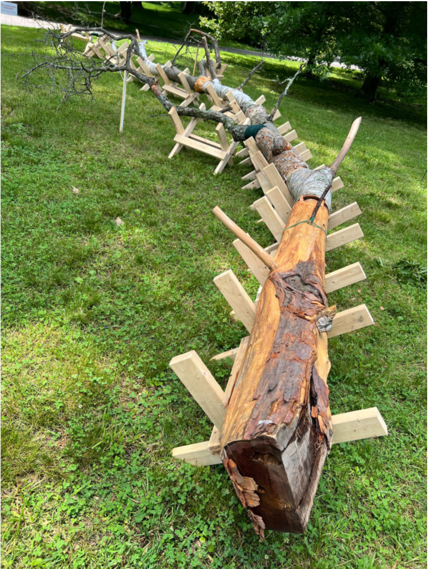
Restoration at the Arnold Arboretum.