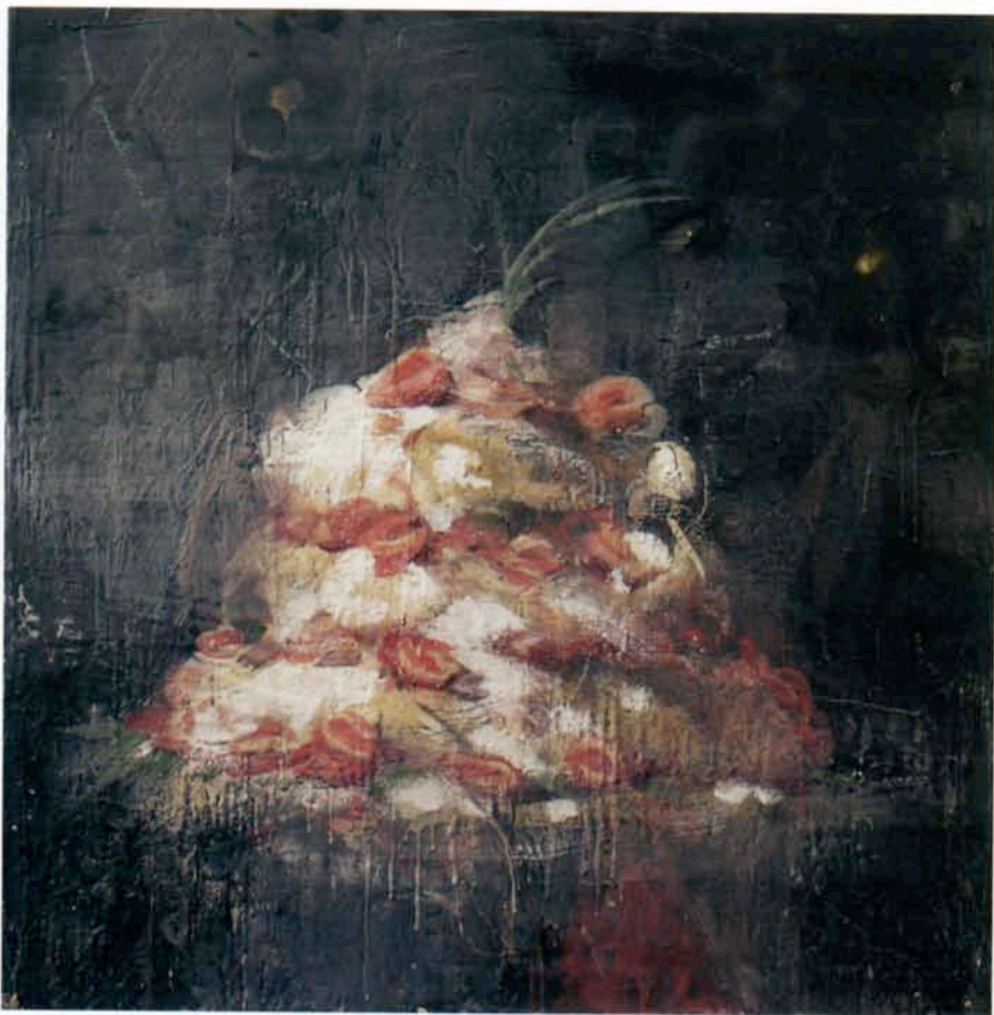
SAVANNAH: BETTER DAYS, ENCAUSTIC ON CANVAS, 48 x 48"