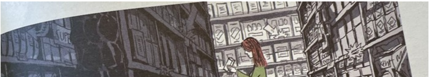
The Long Winter