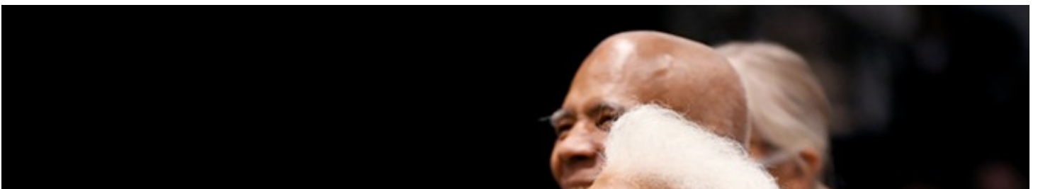
Lieutenant Uhura and the Death of American Progress