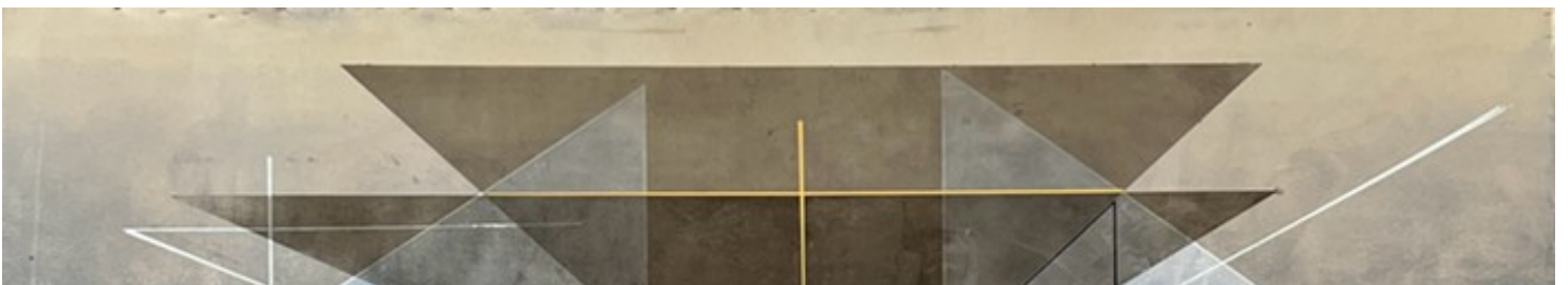
Today's Stranger Suggests: Rodrigo Valenzuela: The New Land