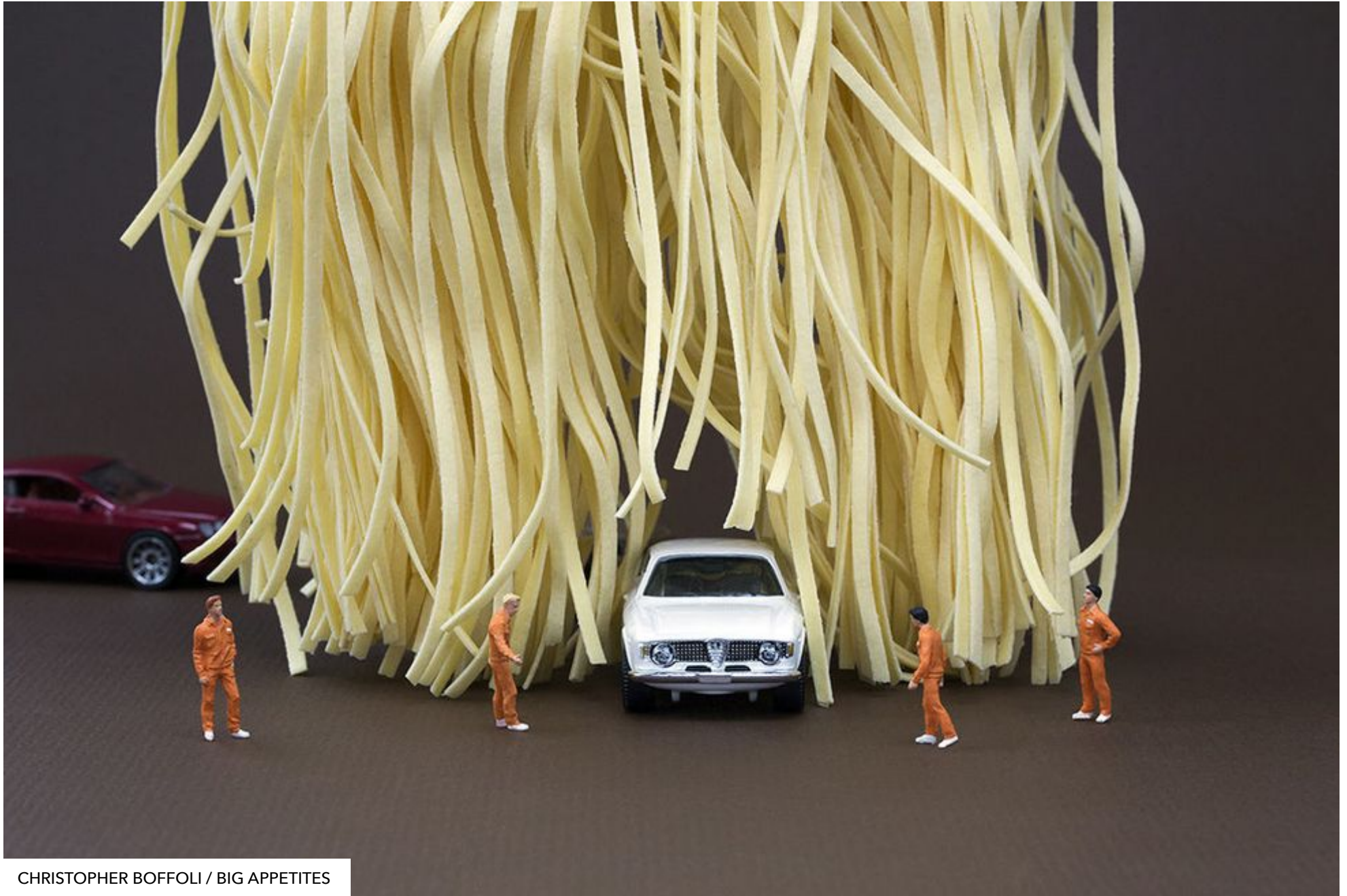
CHRISTOPHER BOFFOLI / BIG APPETITES