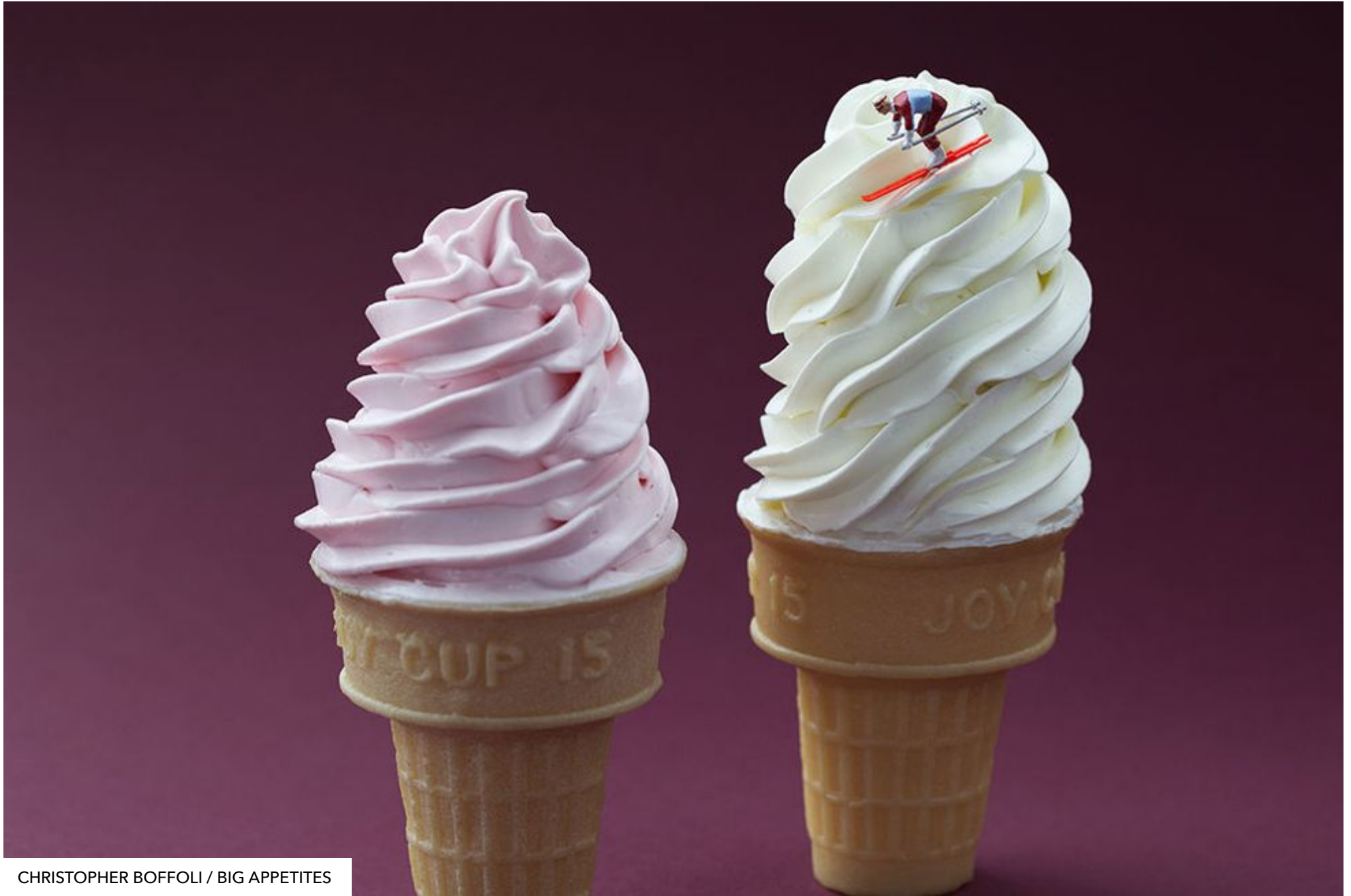
CHRISTOPHER BOFFOLI / BIG APPETITES