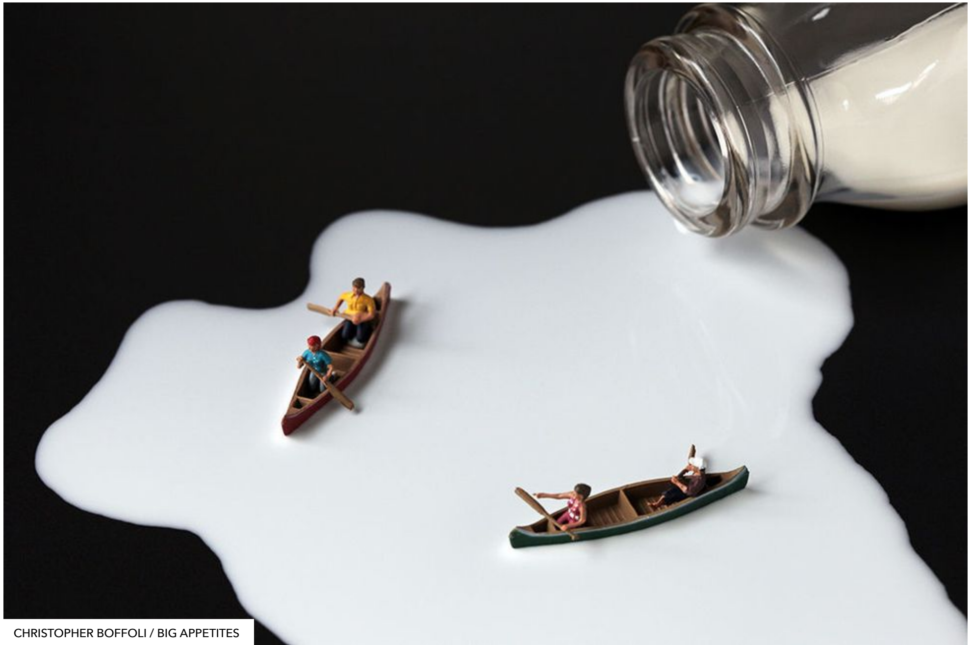
CHRISTOPHER BOFFOLI / BIG APPETITES

Couples spend a romantic afternoon canoeing in pristine white waters.