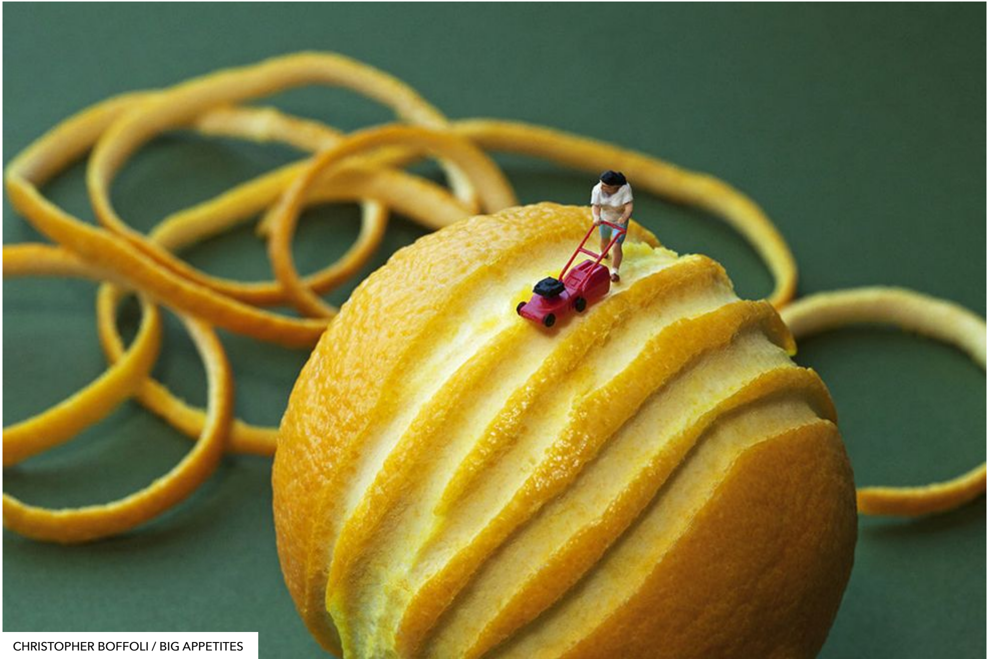
CHRISTOPHER BOFFOLI / BIG APPETITES