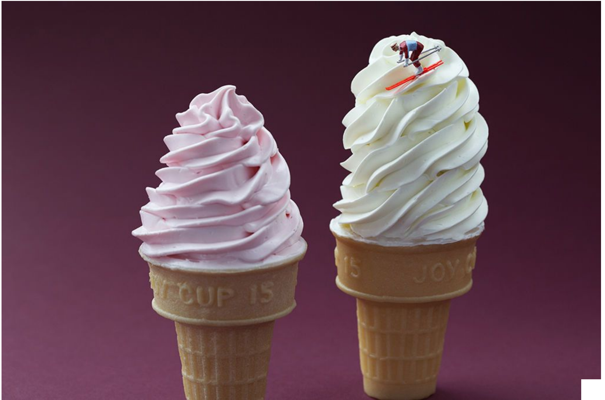
CHRISTOPHER BOFFOLI / BIG APPETITES