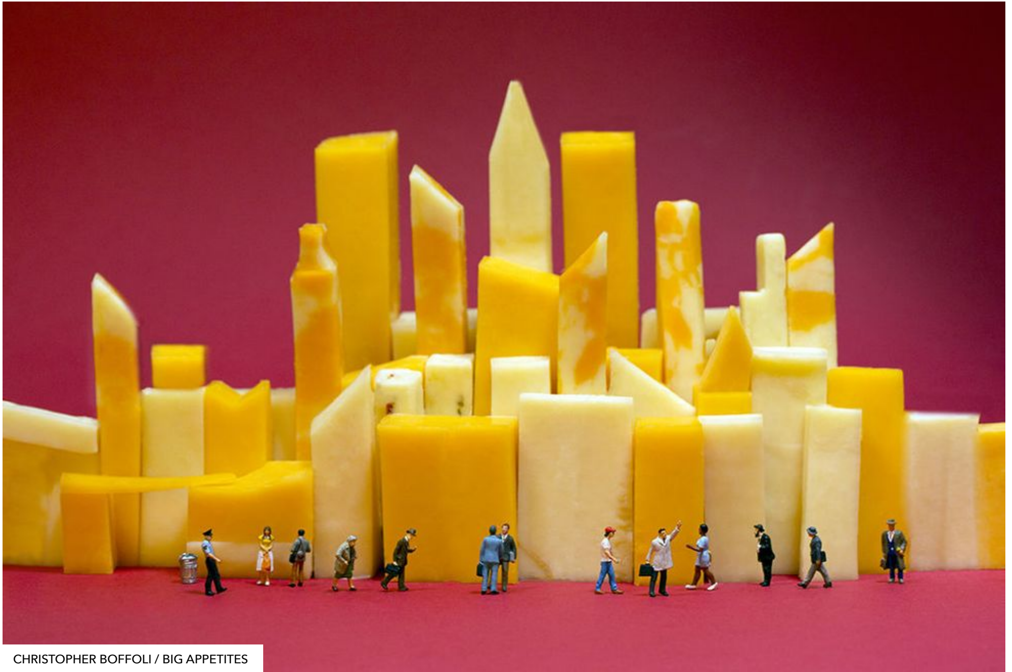
CHRISTOPHER BOFFOLI / BIG APPETITES

Everyone is always scurrying for their own chunk of cheese.