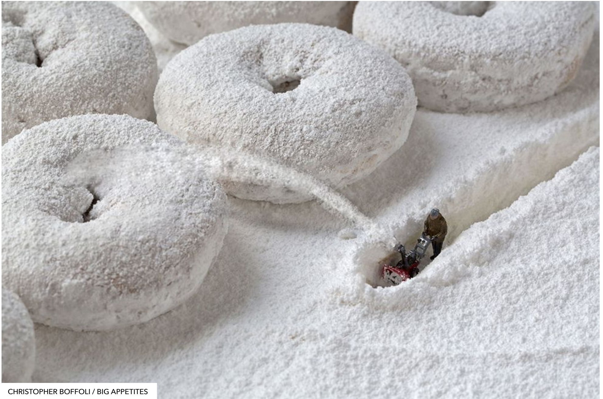
CHRISTOPHER BOFFOLI / BIG APPETITES