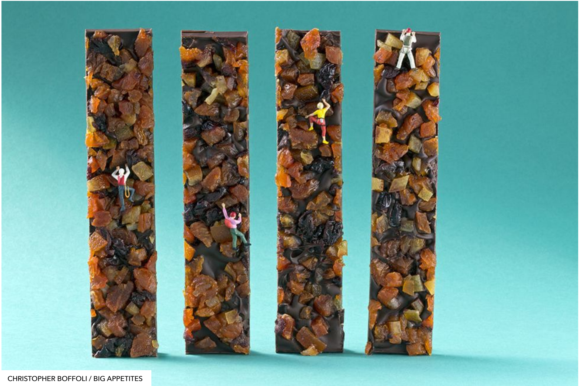
CHRISTOPHER BOFFOLI / BIG APPETITES