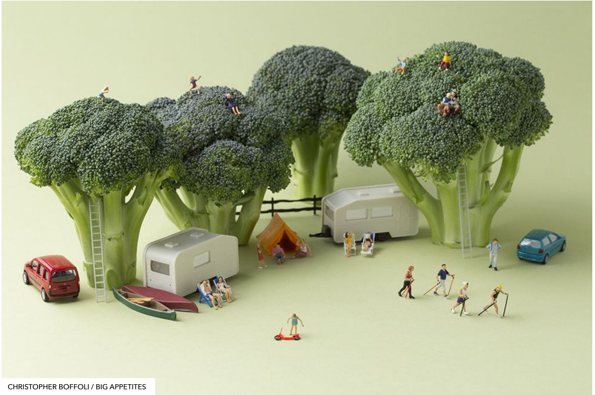
CHRISTOPHER BOFFOLI / BIG APPETITES