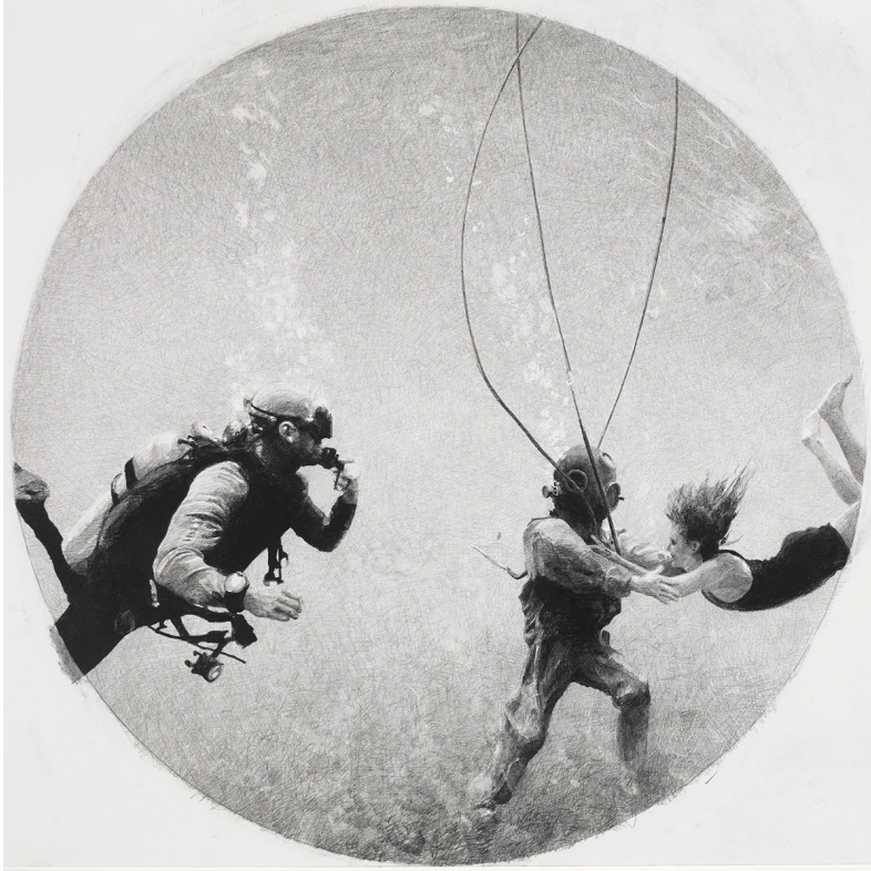
“Lovers Film Proposal” / graphite on paper 24” diameter 2013