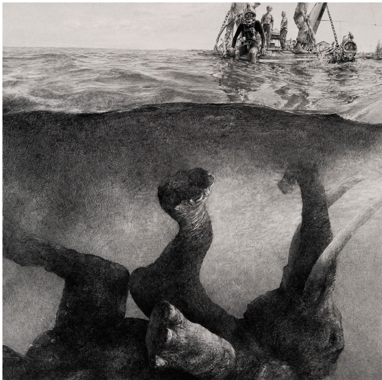
“The Old Aristocratic Colors Break Through” / graphite on paper 48” x 48” 2013

Do stories and artists like this matter to you? Become a Colossal Member today and support independent arts publishing for as little as $5 per month. You’ll connect with a community of like-minded readers who are passionate about contemporary art, read articles and newsletters ad-free, sustain our interview series, get discounts and early access to our limited-edition print releases, and much more. Join now!