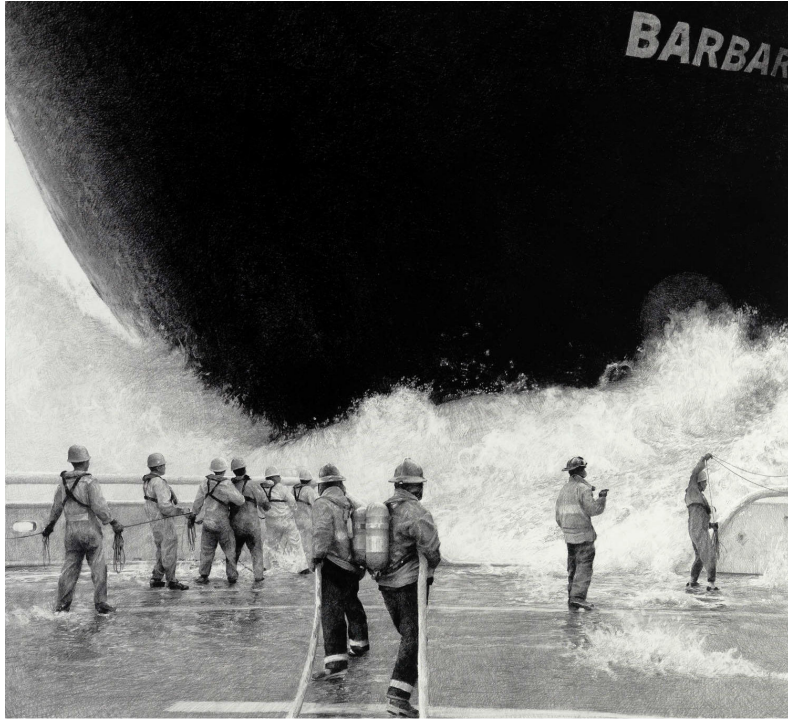
“State of Massachusettes” / graphite on paper 48” x 48” 2014