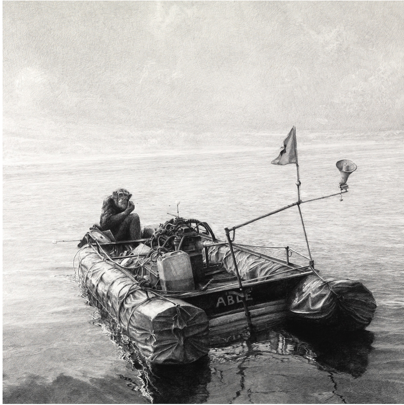
“Early Warning System” / graphite on paper 48” x 48” 2013