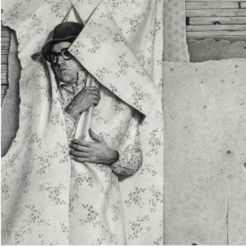
“Betrayal” / graphite on paper 48” x 48” 2012