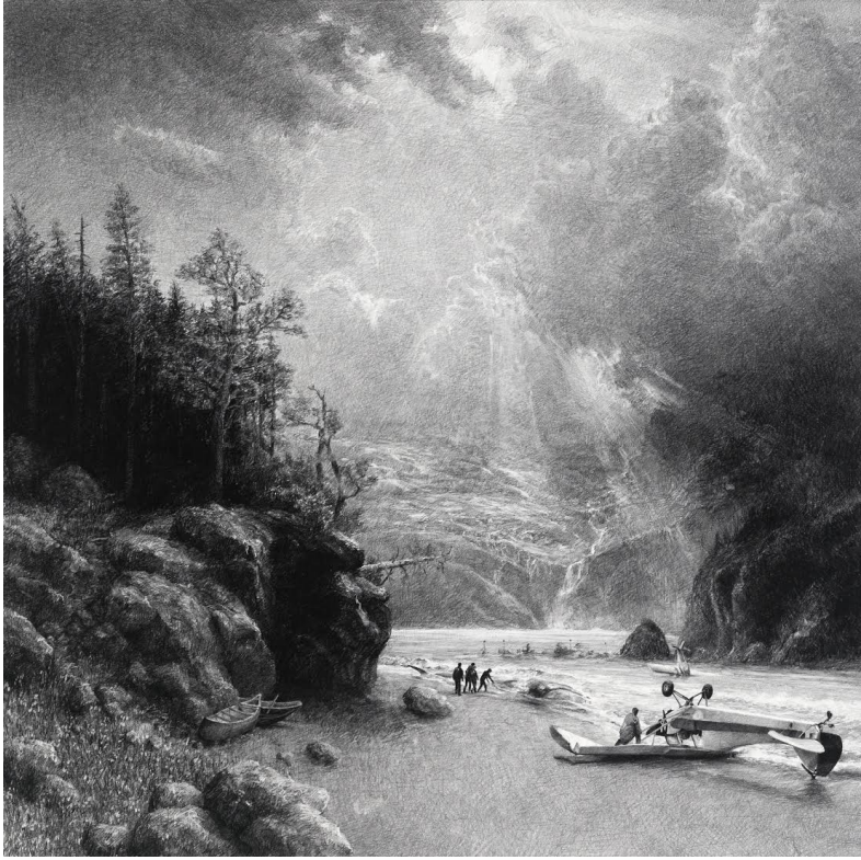
"State of Alaska" / graphite on paper 36" x 36" 2014