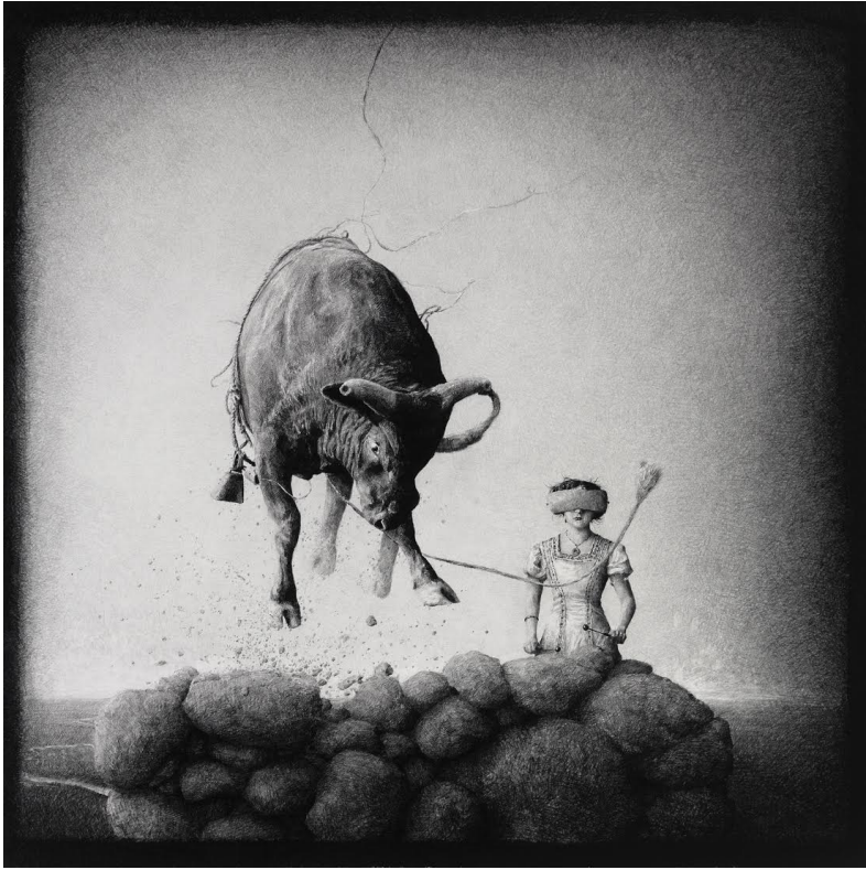
"State of Nevada" / graphite on paper 48" x 48" 2014