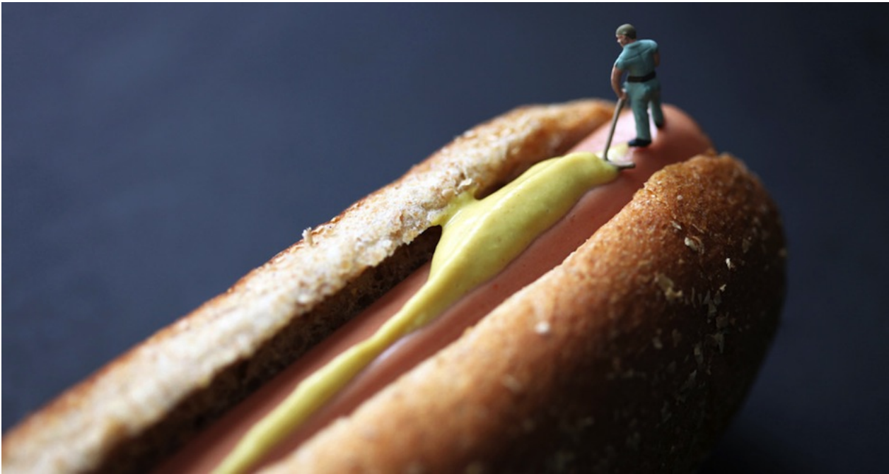
"Gary always used too much mustard. But no one could say so. It was a union thing."

TAGS Galleries , ( /Tag/Galleries ) Lucky Peach , ( /Tag/Lucky-Peach ) Food Photography ( /Tag/Food-Photography )