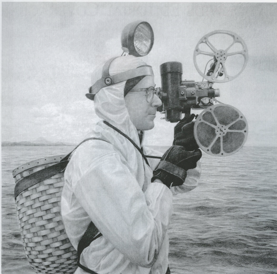
BANVARD AND THE ARTIC RE-PROJECTOR, GRAPHITE ON PAPER, 48 X 48"