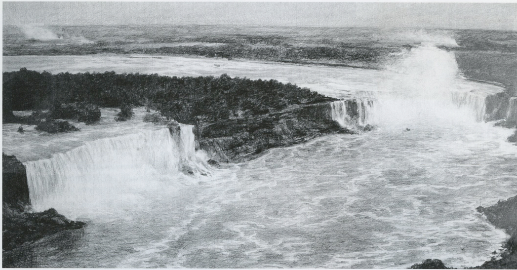
THE "NARWHAL" SEARCHES FOR NARWHALS AT NIAGARA, GRAPHITE ON PAPER, 32 X 68"

and it's good that the works themselves take that in. And, I do it in this style because I also want to glorify drawings by making them larger than life."