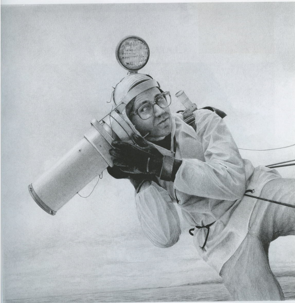
BANVARD AND THE WHALE METER, GRAPHITE ON PAPER, 72 X 72"

unprepared and pretty consistently doomed to failure."