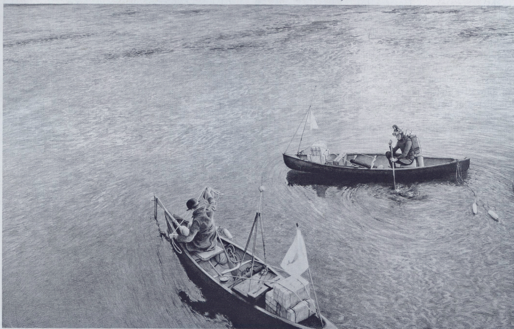
OFF OF GASPÉ, READY TO DIVE FOR THE ELUSIVE WHALE, GRAPHITE ON PAPER, 60 X 96"

"I embroil myself in a history of aspiration filled with brilliant new finds and ignorant mistakes," says Murrow. "I've become more and more interested in telling stories about people obsessed