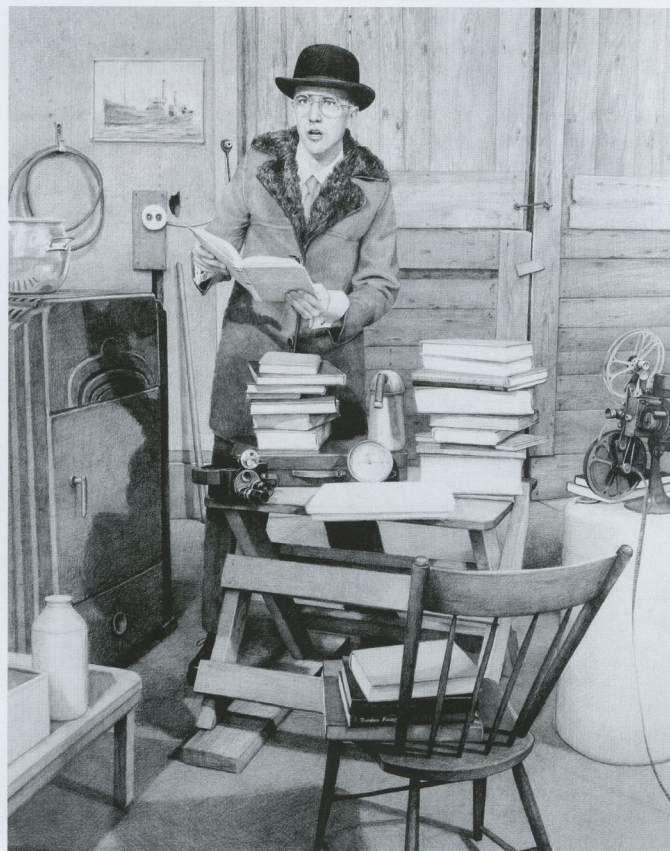
WHILE READING THE EXPOSE AT THE WHALE RESEARCH STATION, BARNUM REALIZES THE HOAX IS UP, GRAPHITE ON PAPER, 72 X 57"

"The characters live the line between genius and fools," says Murrow. "I like the characters to appear