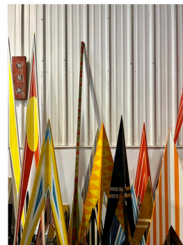
The Rockets, 2016-2018.