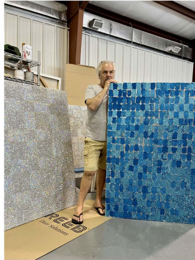
Right Blue Wave, 2022. Left Magic Carpet Ride, 2022.