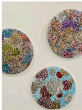
Camellias for Chanel, 2005.