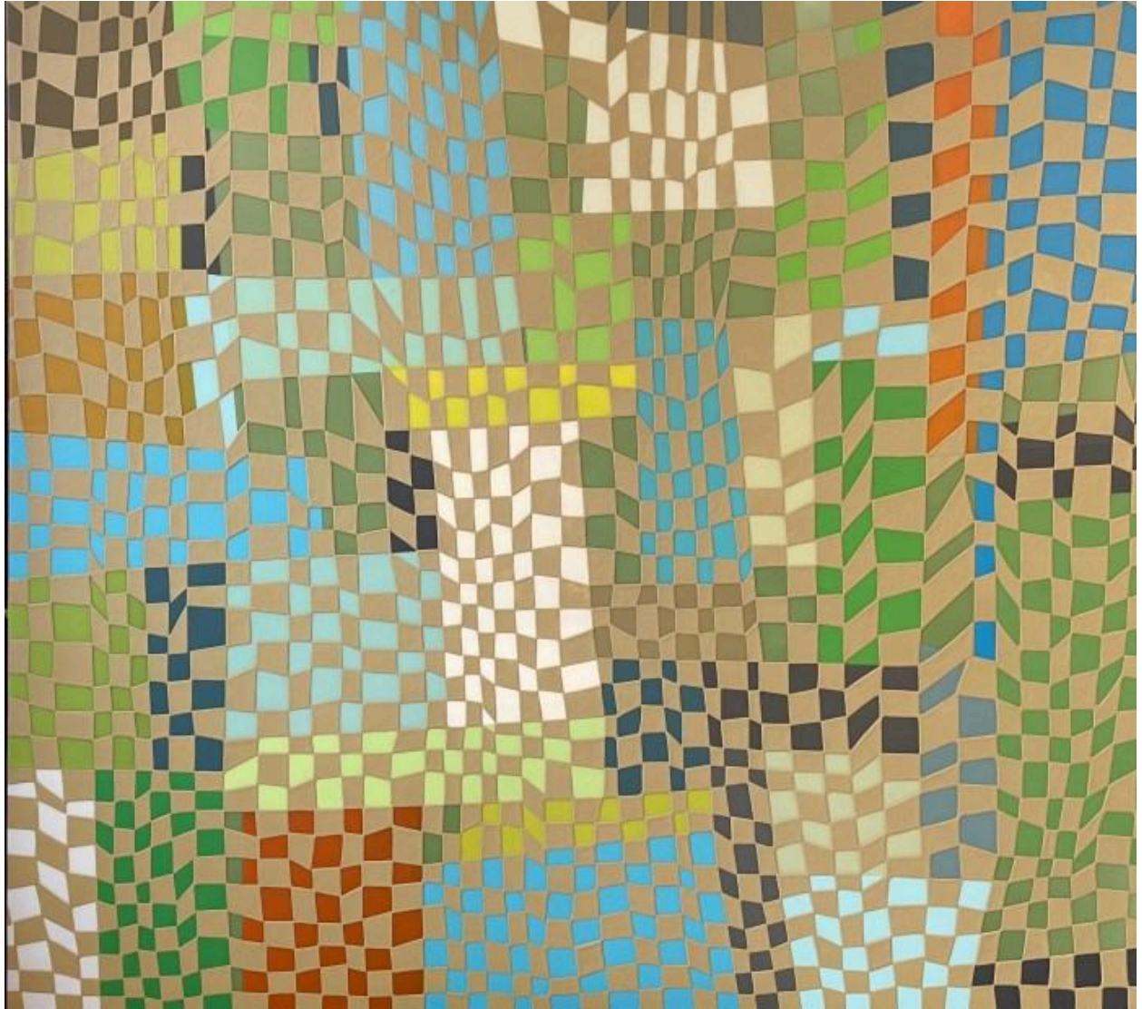
Pole Star 1, 2022, acrylic on canvas over panel, 52 x 58"