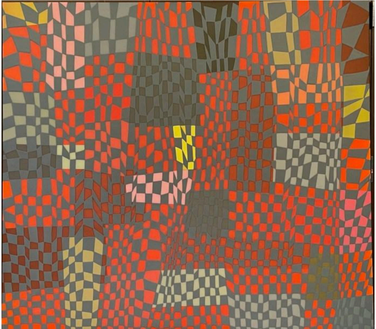
Secret Cave of the Heart 1, 2022, acrylic on canvas over panel, 58 x 52"