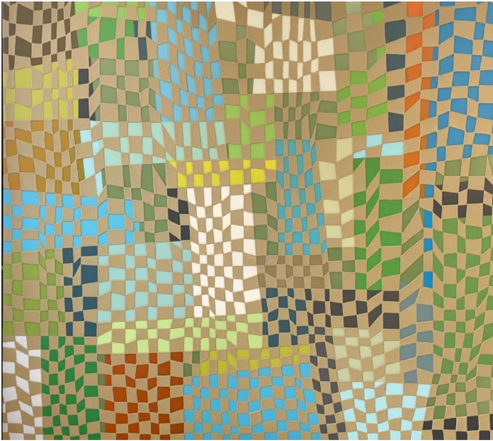
Pole Star 1, 2022, acrylic on canvas over panel, 52 x 58"