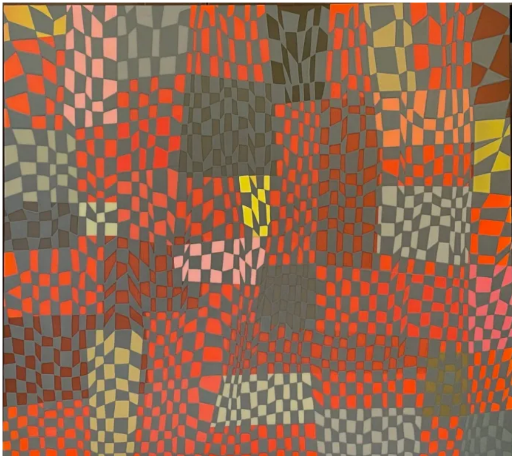
Secret Cave of the Heart 1, 2022, acrylic on canvas over panel, 58 x 52"