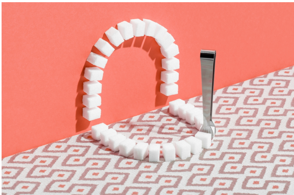
"Sugar Teeth — Fixing" by Marion Luttenberger, 2014. Pigment print, 20 by 26 inches. Courtesy Marion Luttenberger.

Such complex psychological themes might seem to be outside the usual tastes of Shelburne Museum's audience. While the museum has increasingly presented important exhibitions of Twentieth and Twenty-First Century art in recent years, in many circles it remains best known for the palatable genres of French Impressionism and American folk art. In fact, sugar and its sins are baked into the history of the museum and its collections – in more ways than one. The museum's founder, Electra Havemeyer Webb, was the daughter of H.O. Havemeyer, whom Rogers describes as the "sugar king of America" in his day. "