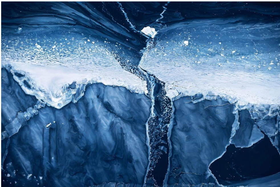
Weddell Sea Southeast off the tip of the Antarctic Peninsula.