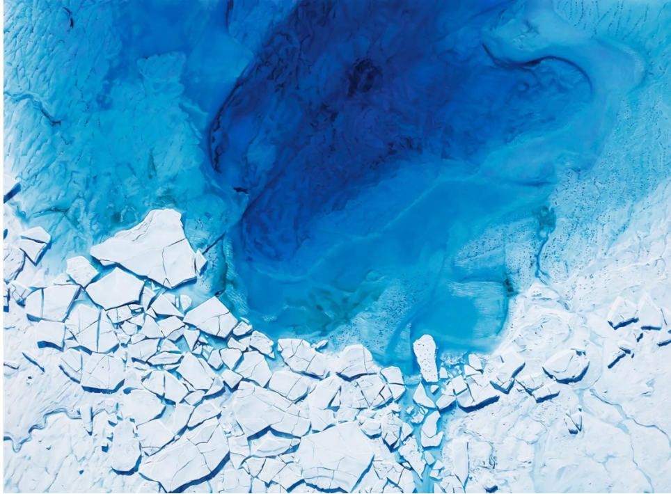
Supraglacial Lakes between Hiawatha and Humboldt Glaciers, Greenland.