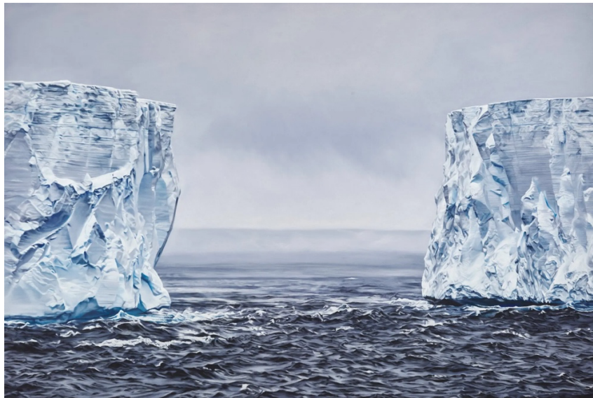
Iceberg Antarctica.