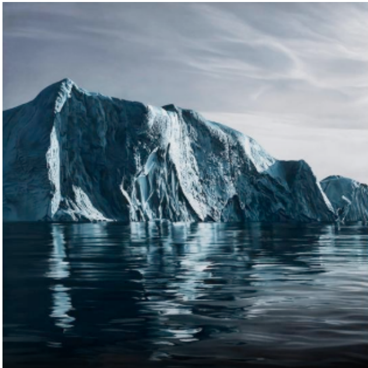
Greenland no. 62, 47"x70", Soft pastel on paper, 2013 (Zaria Forman)