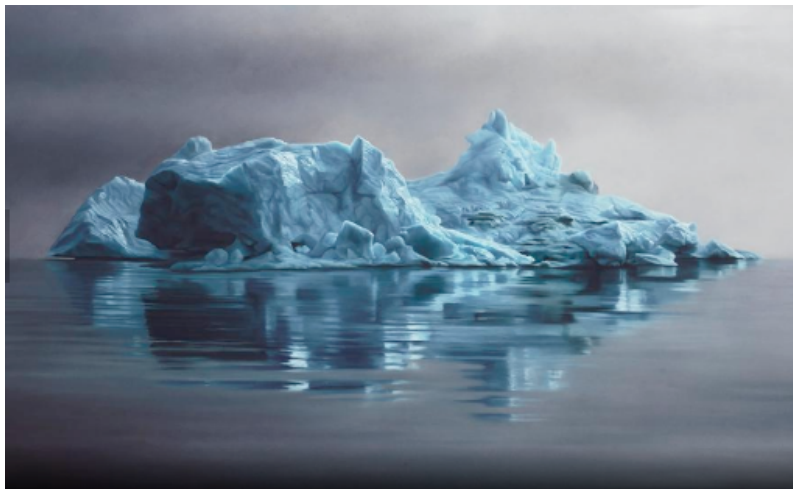
Greenland no.62, 47"x70", Soft pastel on paper, 2013 (Zaria Forman)