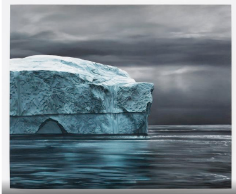
Greenland no.71, 50"x60", Soft pastel on paper, 2014 (Zaria Forman)