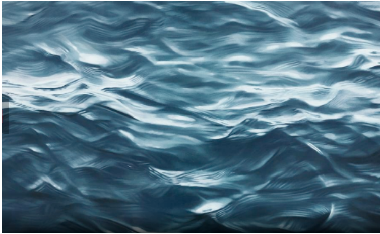
Greenland no. 58, 30"x44", Soft pastel on paper, 2013 (Zaria Forman)