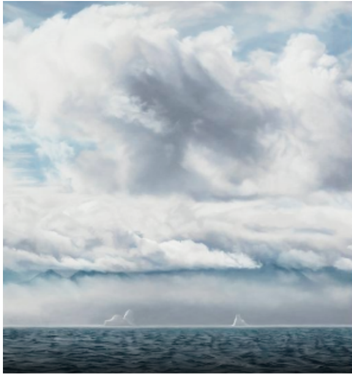
Greenland no.73, 60"x64", Soft pastel on paper, 2014 (Zaria Forman)