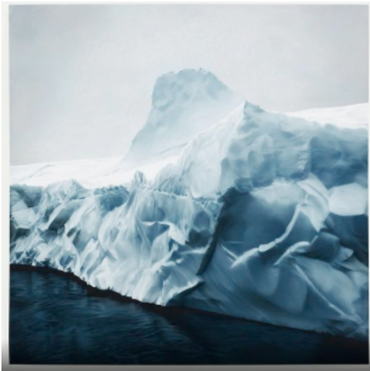
Greenland no.72, 60"x60", Soft pastel on paper, 2014 (Zaria Forman)