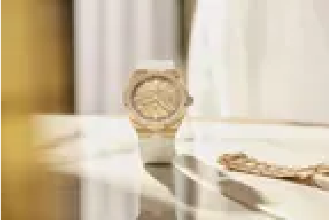
Vacheron Constantin Overseas watch VACHERON CONSTANTIN

equipped with a stop-second mechanism for precision setting and offers 40 hours of power reserve. The finely finished movement, with gold rotor engraved with a compass rose, is visible via the transparent sapphire case back. Like all Vacheron Constantin watches, it carries the Hallmark of Geneva. It is sold with two additional straps: a sporty white textured rubber strap and a white-stitched white leather strap.