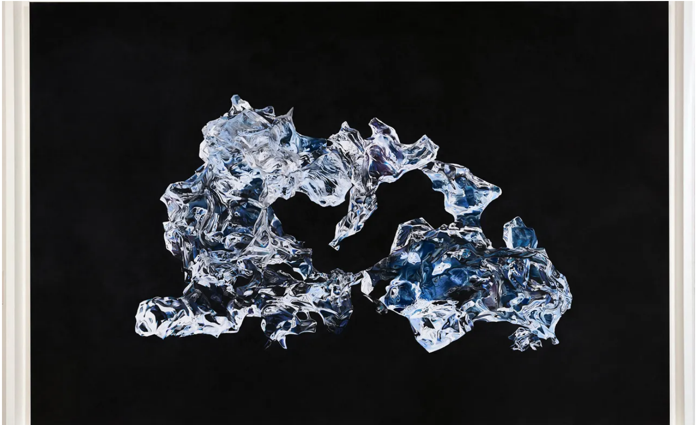
Fellsfjara, Iceland no.3