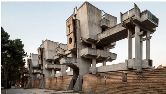
Best of brutalist Italian architecture chronicled in new book