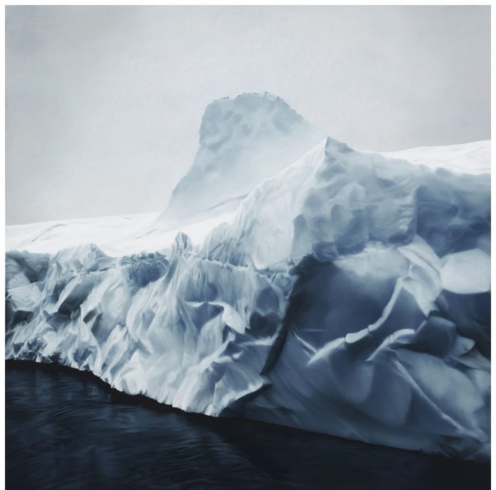
From left: Greenland #69, Greenland #72, soft pastel on paper, 2014. ZARIA FORMAN (2)

“I’m really interested in the nuances of ice, the colors and textures. Those are the little details that you don’t get unless you travel there,” she says.