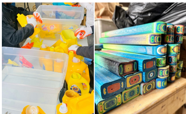
Inside the Happy Returns studio

This virtual conversation is hosted by the Design Museum of Chicago and will be recorded. Register here.