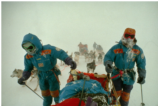
A still from 'After Antarctica'