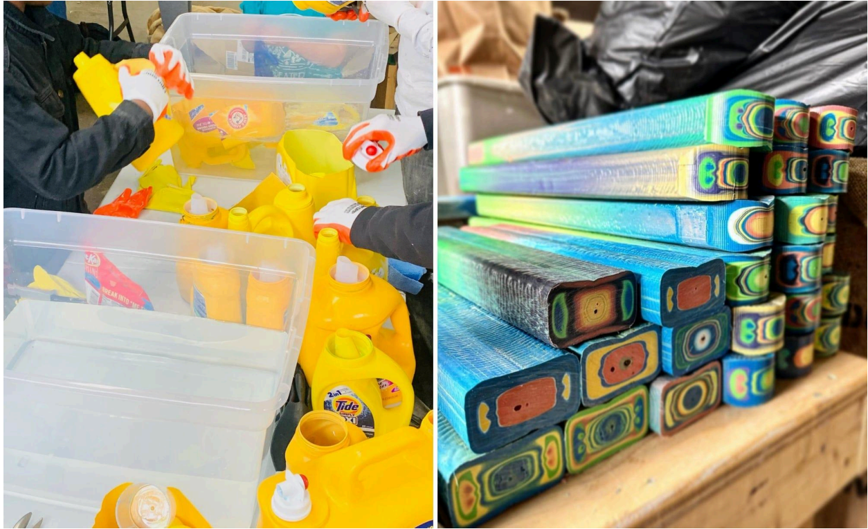
Inside the Happy Returns studio