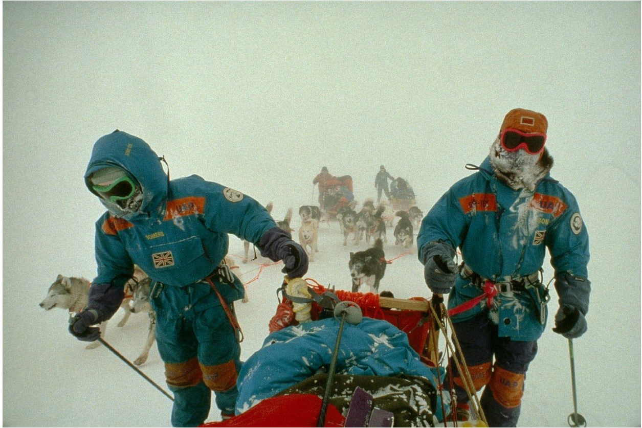
A still from 'After Antarctica'