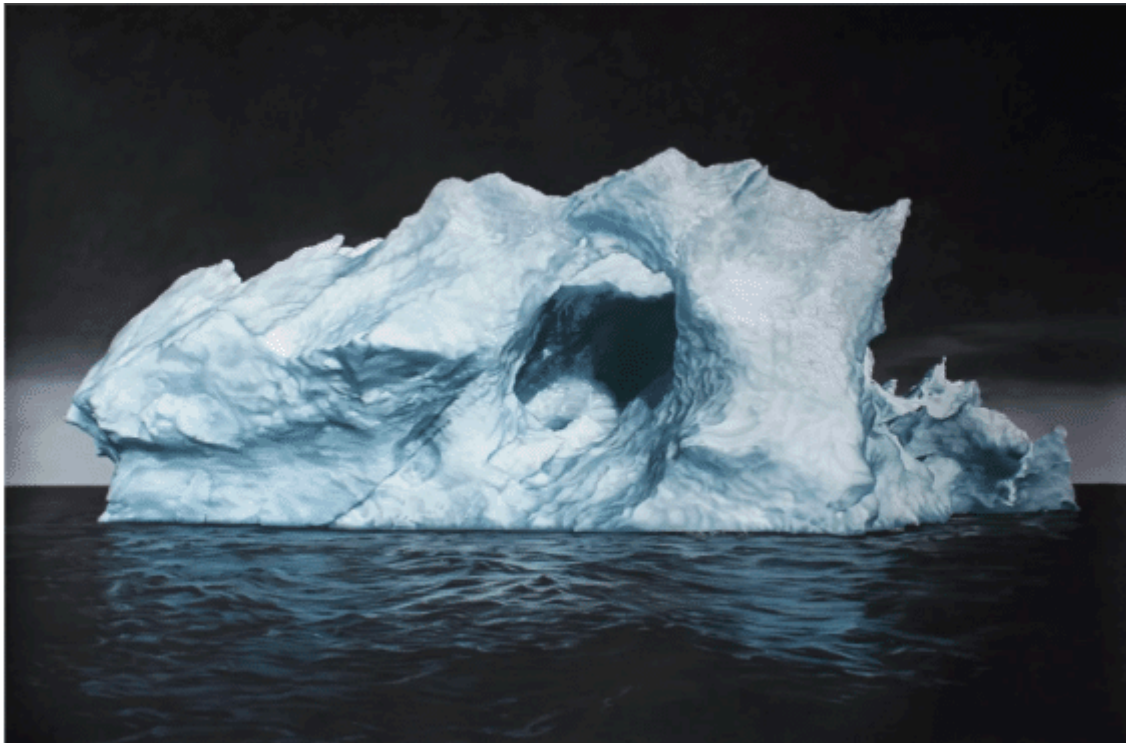
Zaria Forman, Svalbard #33, 60" x 90," soft pastel on paper

For two decades, Forman has traveled with and without scientists to remote regions all over the world collecting images and inspiration for her work, which is exhibited worldwide. Her highly detailed pastels meticulously document and bring attention to these rapidly changing landscapes.