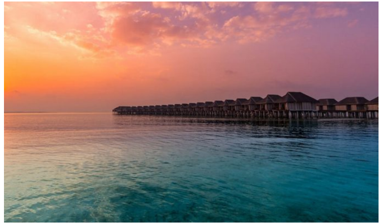
( https://www.salonprivemag.com/festive-charm-at-lux-south-ari-atoll/ )

$68 Million Golden Beach Beachfront Compound Hits The Market ( https://www.salonprivemag.com/68-million-golden-beach-beachfront-compound/ )