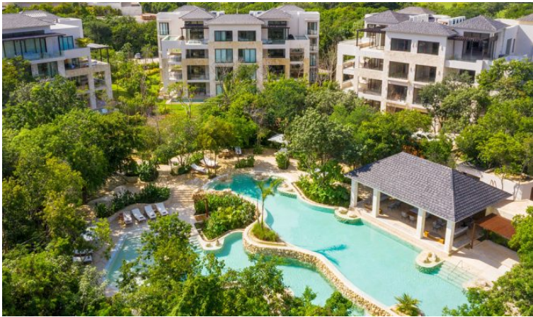
( https://www.salonprivemag.com/step-inside-the-last-mayakoba-penthouse/ )

Scandinavian Festive Charm at LUX* South Ari Atoll ( https://www.salonprivemag.com/festive-charm-at-lux-south-ari-atoll/ )