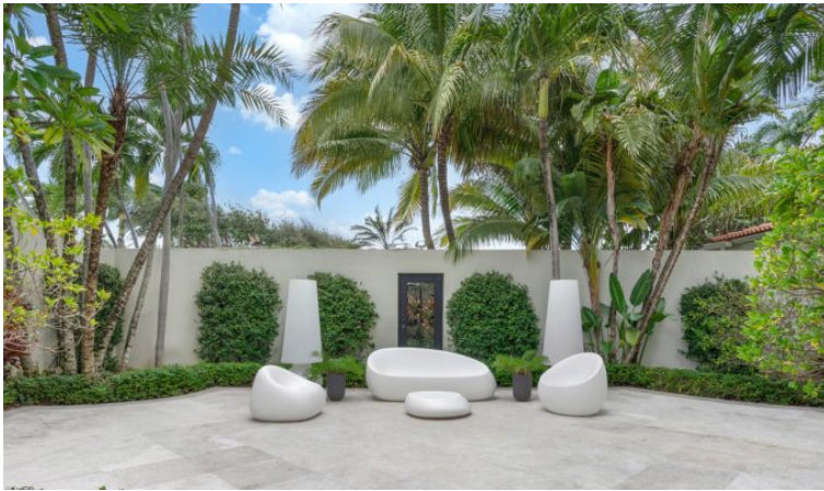
( https://www.salonprivemag.com/68-million-golden-beach-beachfront-compound/ )

$68 Million Golden Beach Beachfront Compound Hits The Market ( https://www.salonprivemag.com/68-million-golden-beach-beachfront-compound/ )