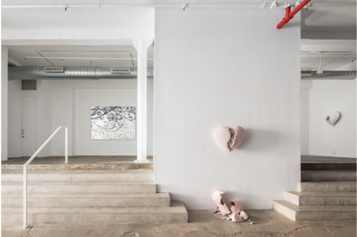
"A Perfect storm," Installation View at Winston Wächter Fine Art, 2021.

"There are always storms," Lichtenstein continued. "It became more apparent during the lockdown as we went through our turmoils, separate but together. The angst became awful and beautiful at the same time. Once I got these lockets and engraved them all, I wanted to have these words and thoughts and emotions sort of spilling, pouring, exploding out. Buried inside, cracked open. All the things that make up a human heart."