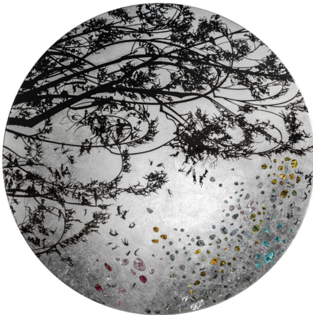
"And noew, I'm different than before,' 2020, Wood, epoxy, aluminum leaf and mother of pearl. 70 x 70 x 30 inches.