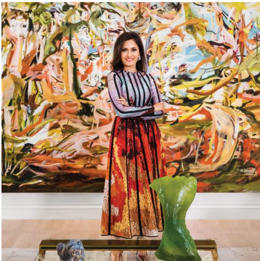
( https://galeriemagazine.com/women-changing-the-art-world-2023/ )

Tour Diana Al-Hadid's Expansive Brooklyn Studio ( https://galeriemagazine.com/diana-al-hadid-studio-tour/ )