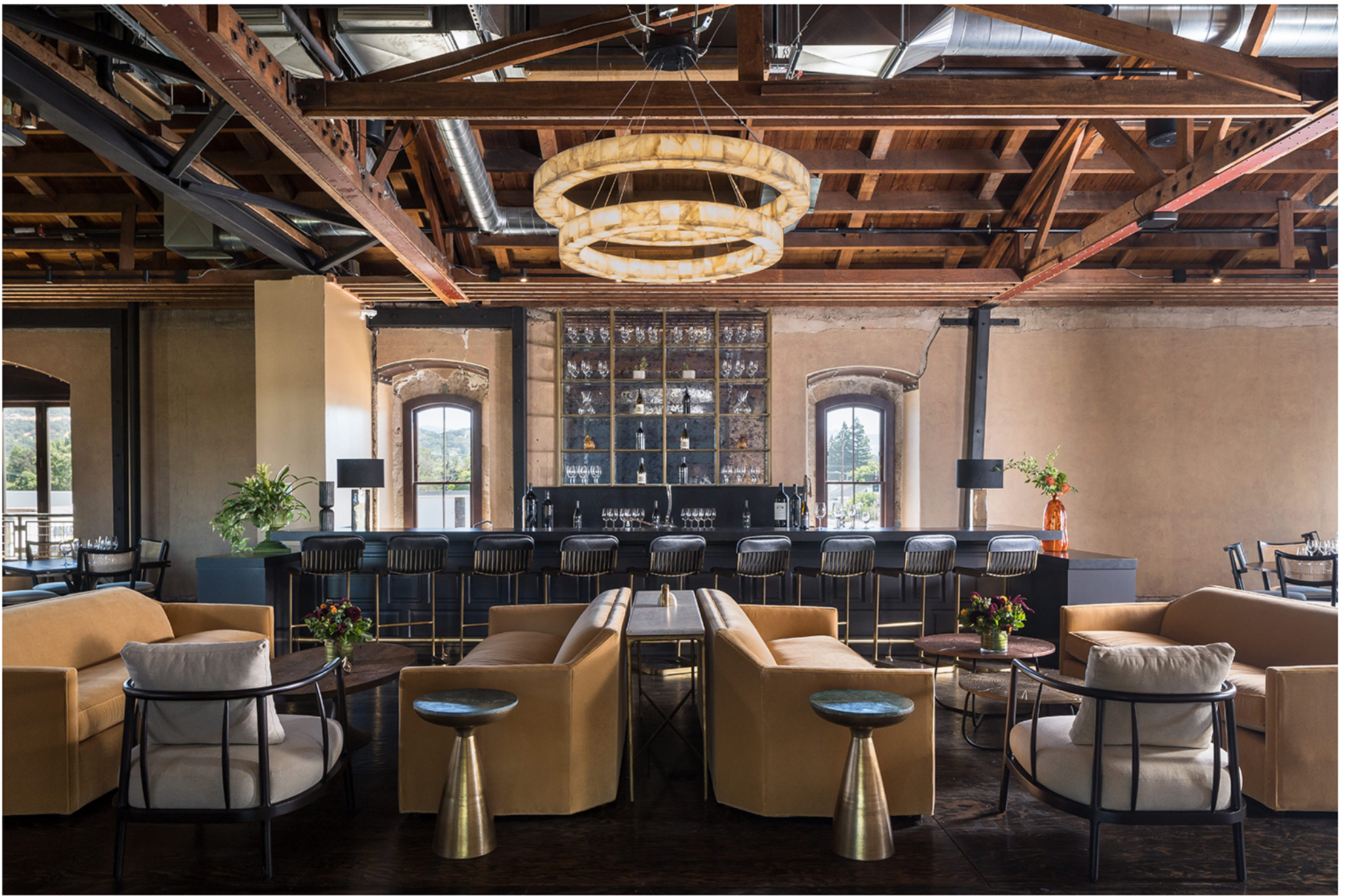
Arch & Tower in Downtown Napa.