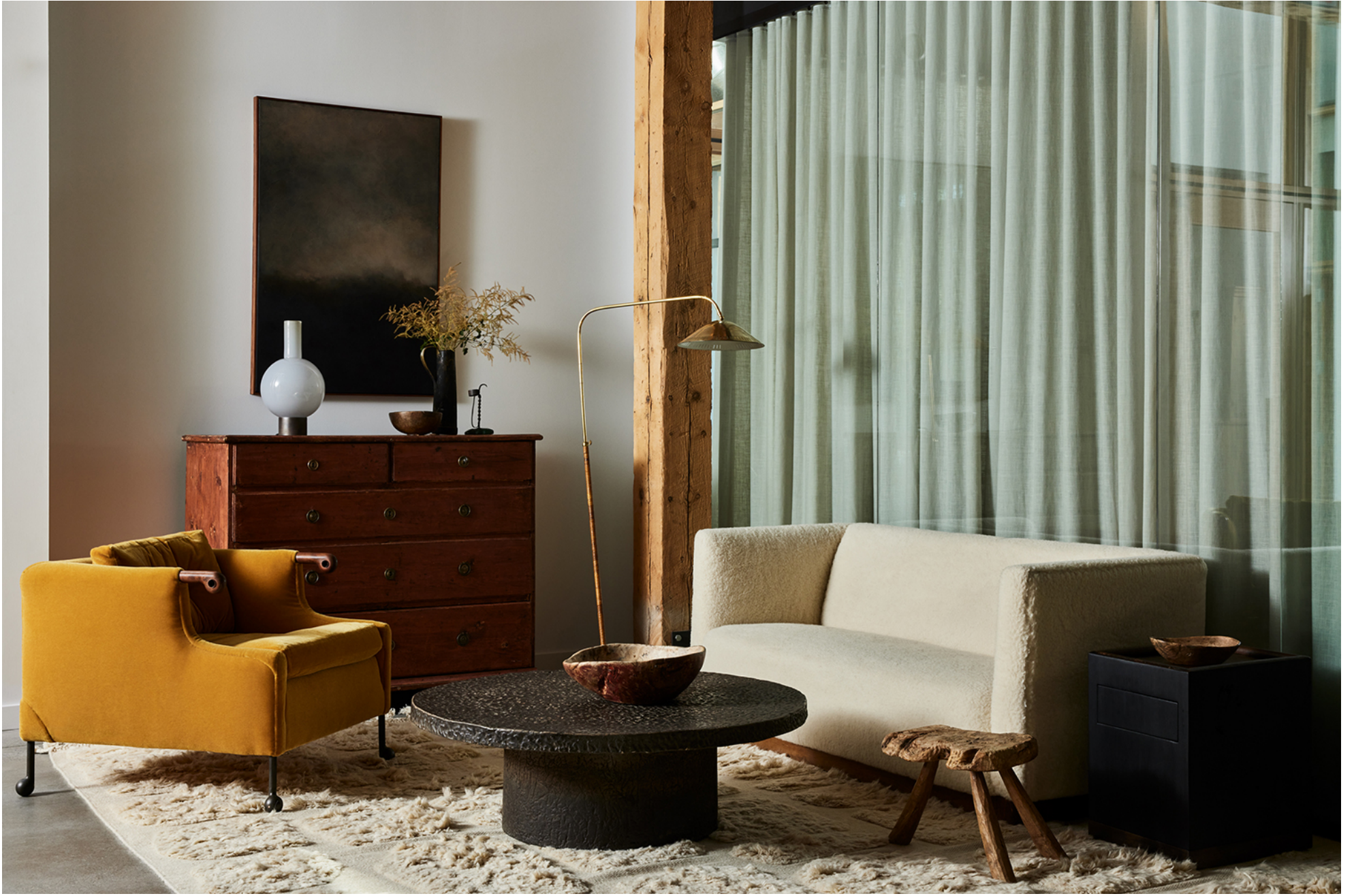
Emerson Bailey's new showroom in Bozeman, Montana.