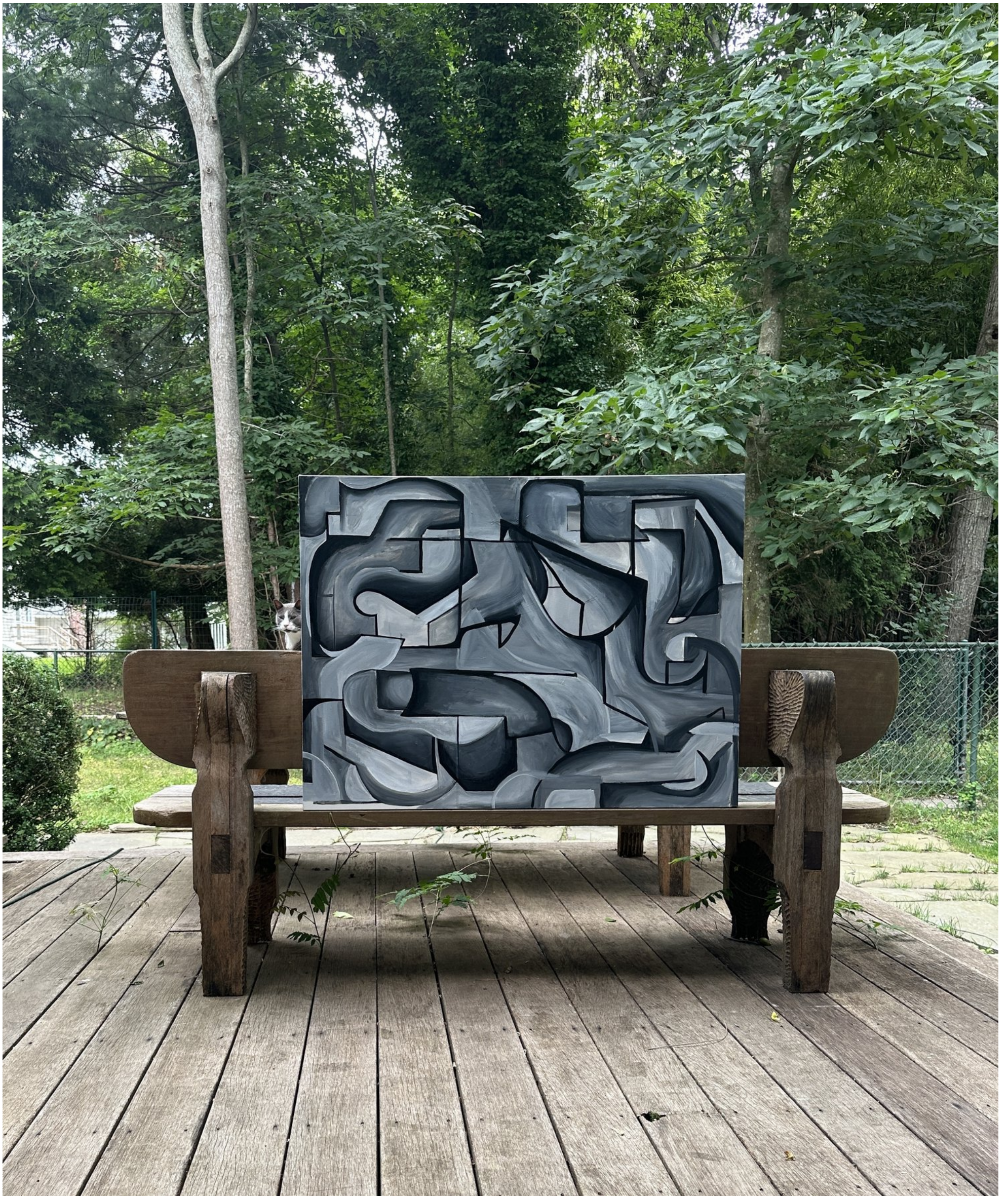
A new work by Lucy Villeneuve