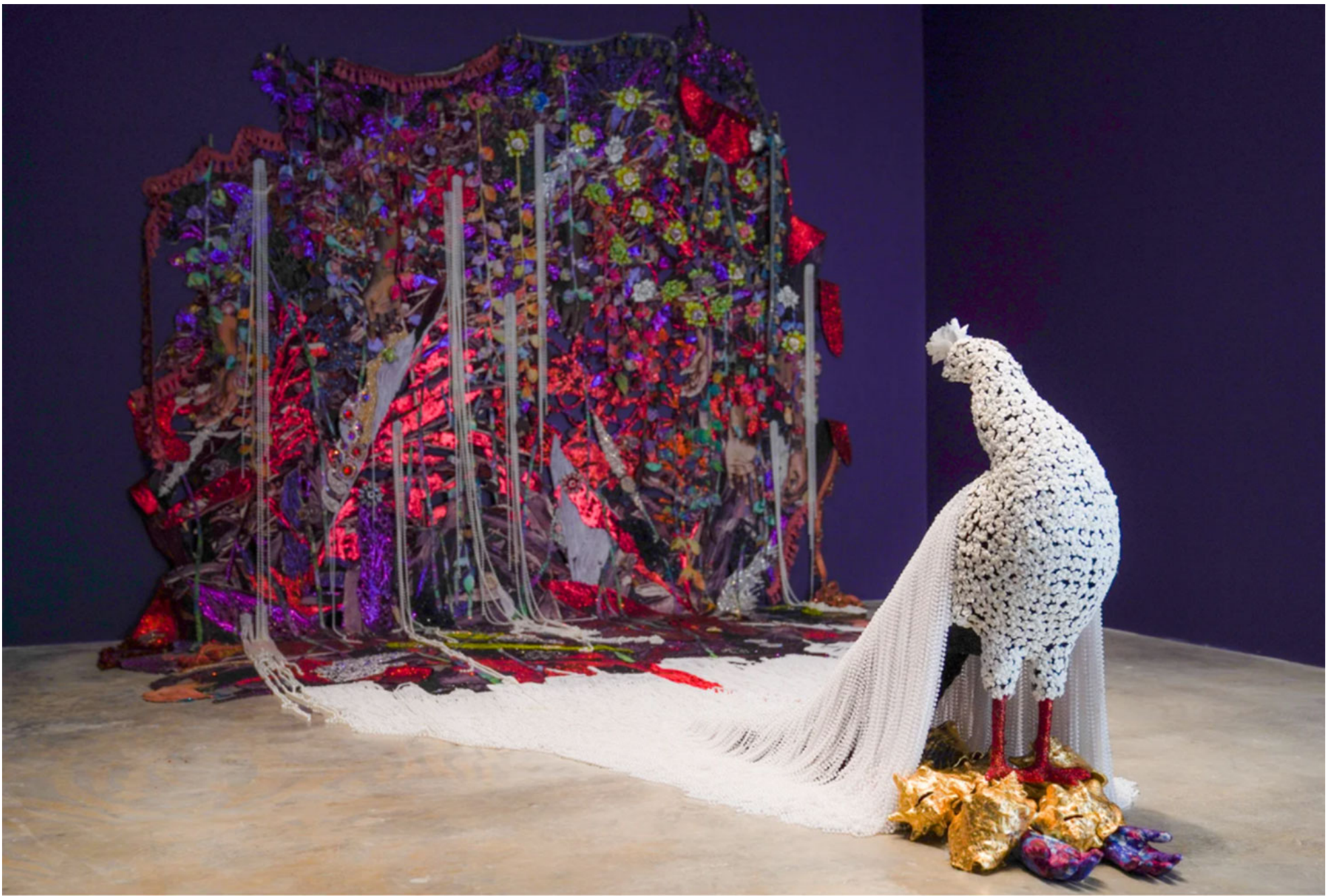
When the land is in plumage (2020) by Ebony G. Patterson