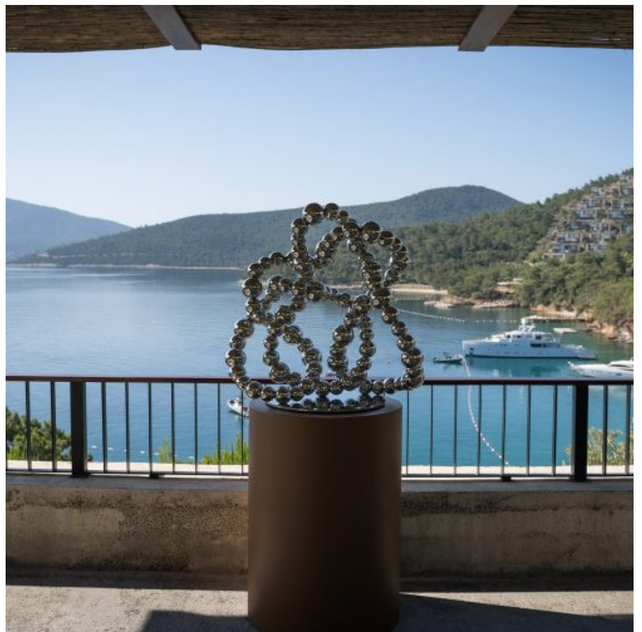
( https://galeriemagazine.com/perrotin-gallery-transforms-bodrum-loft-art-wonderland-summer/ )

Meet 6 Powerhouse Women Shaping the Art World ( https://galeriemagazine.com/women-changing-the-art-world-2023/ )