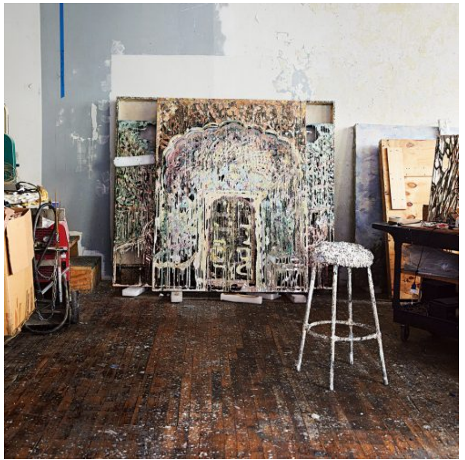
( https://galeriemagazine.com/diana-al-hadid-studio-tour/ )

The Ultimate Guide to Culture, Art, and More in Washington, D.C. ( https://galeriemagazine.com/dc-art-guide/ )