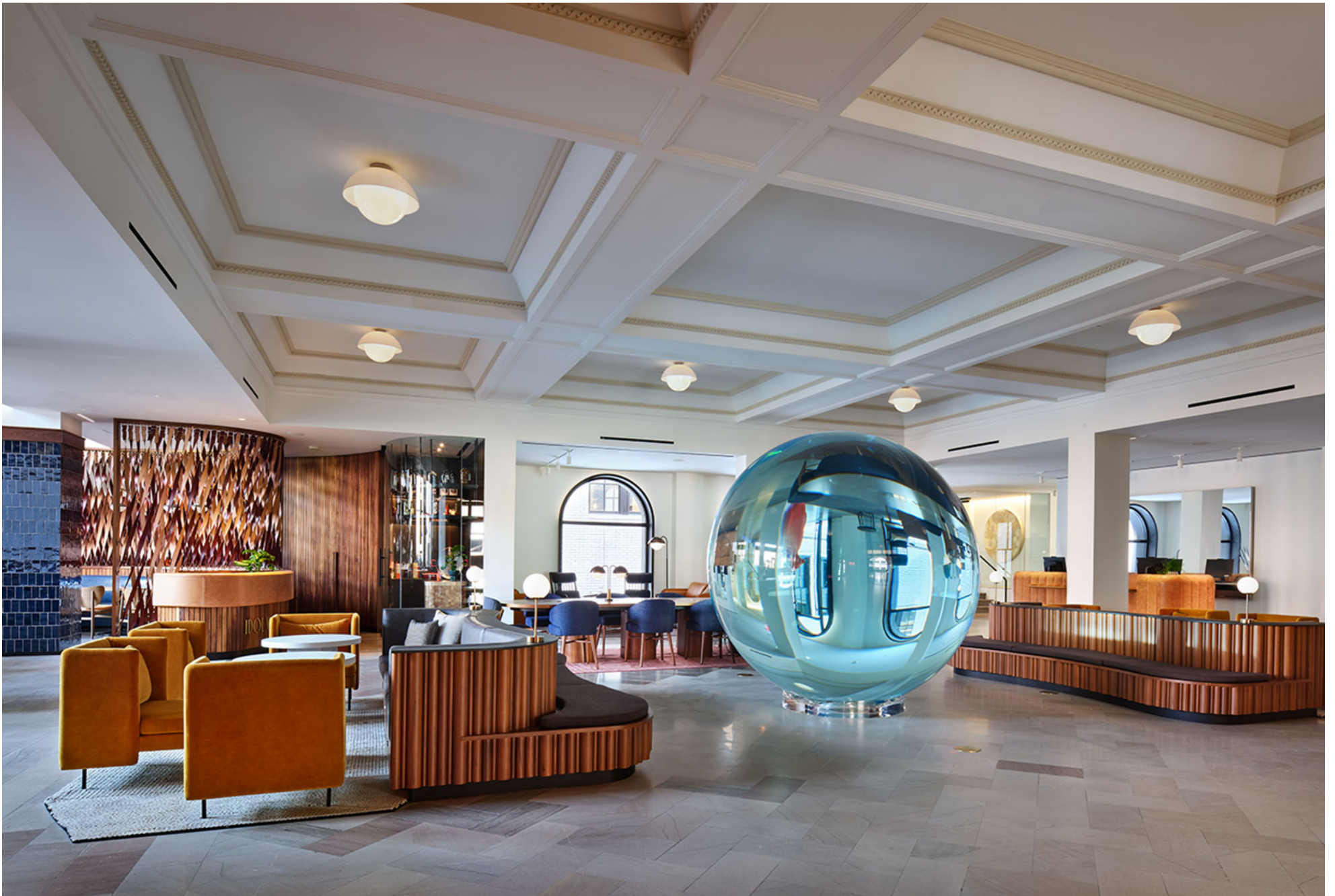
The lobby of 21C Museum Hotel St. Louis.