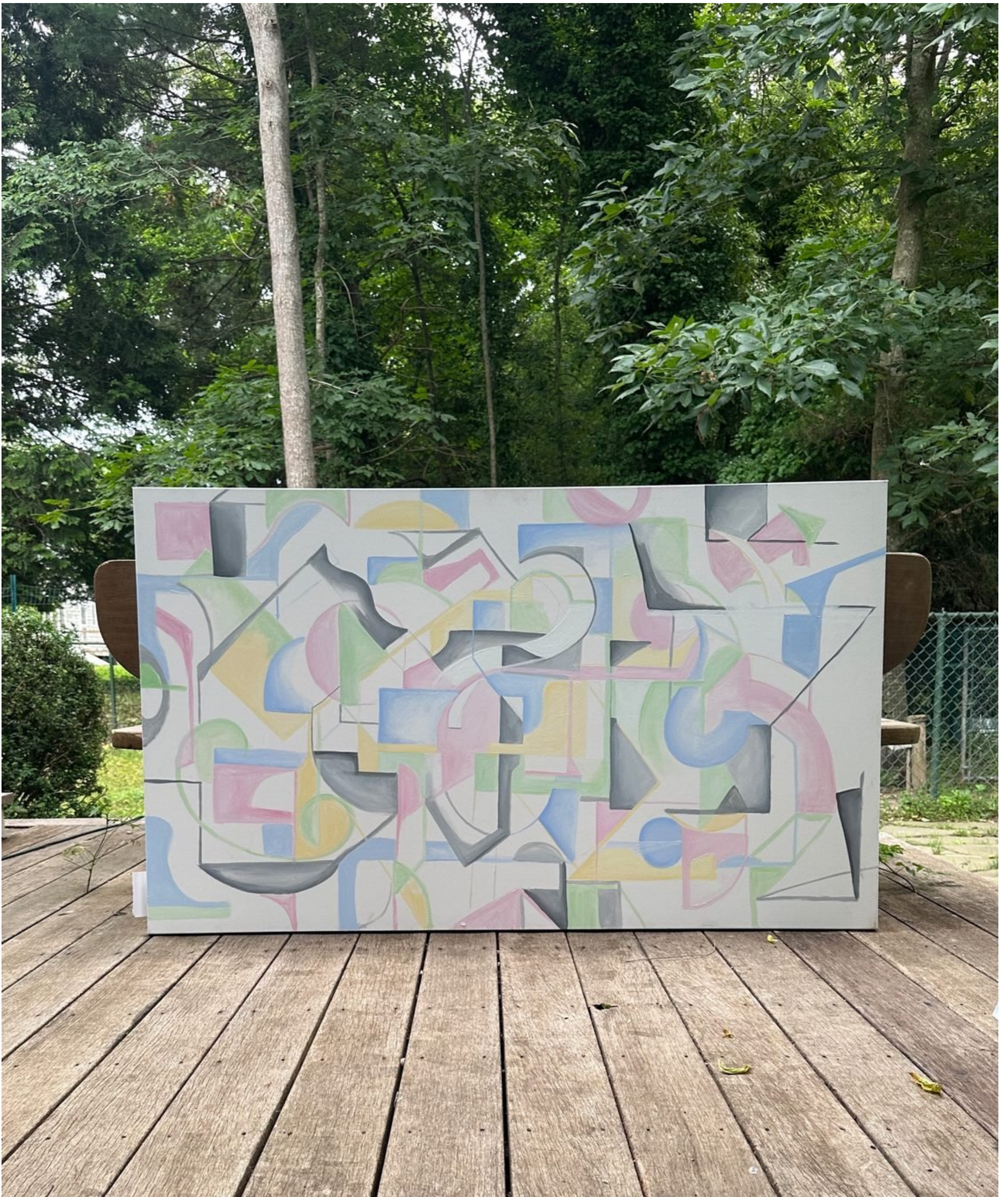
A new work by Lucy Villeneuve