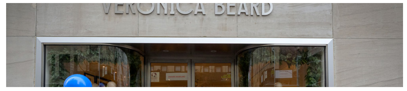
SOCIAL DIARY Dec 5