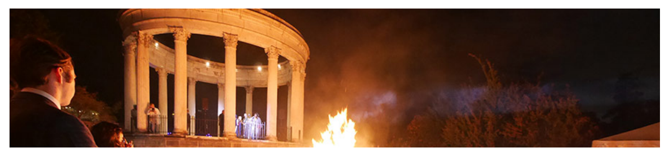
PARTY PICTURES Dec 4