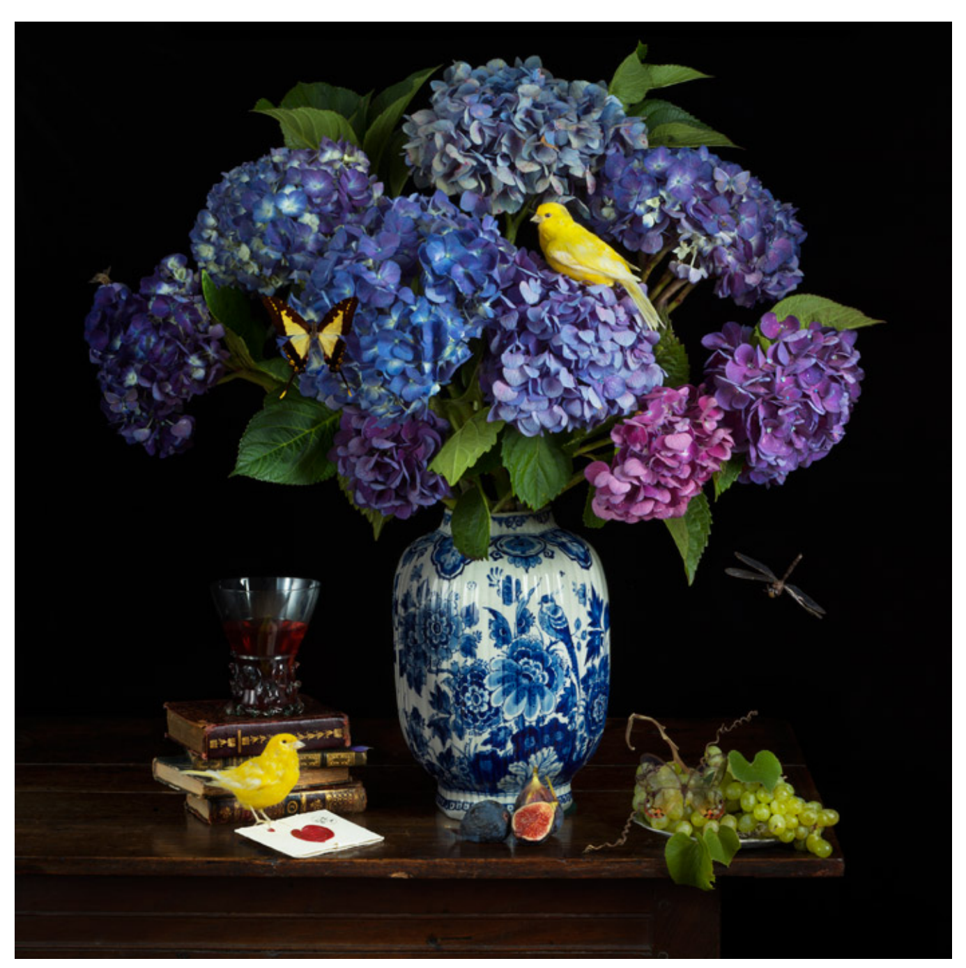
Paulette Tavormina, Blue Hydrangeas & Yellow Canaries, 2022.

Zurbarán 's attention to lighting. To create her images, Paulette often works against the clock with freshly picked flowers and fruit from her garden.