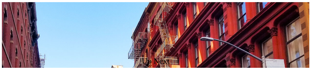
GUEST DIARY Dec 6