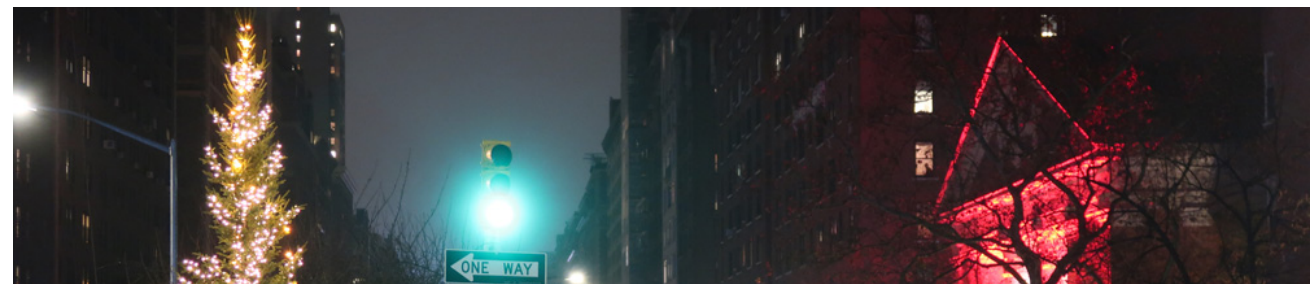
SOCIAL DIARY Dec 4