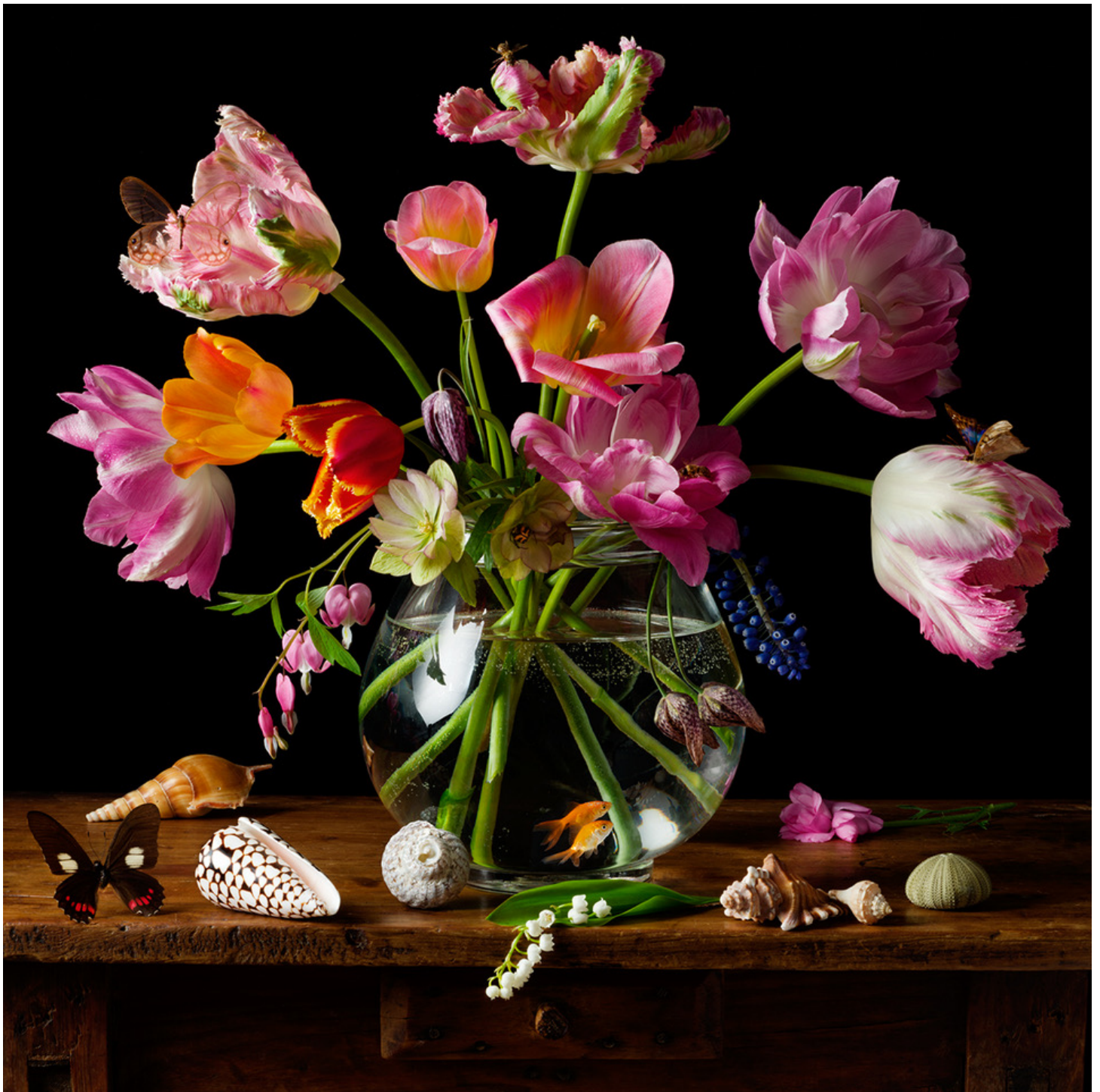
© Paulette Tavormina, Dutch Tulips & Goldfish, 2021, Archival pigment print