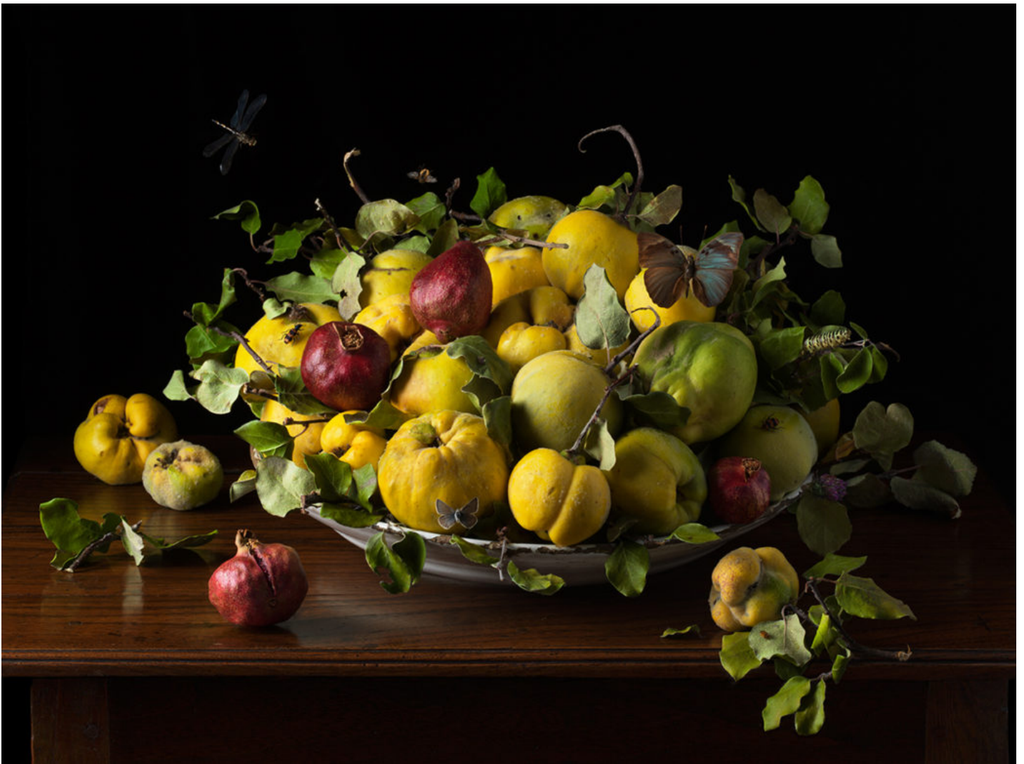
© Paulette Tavormina, Orchard Quince, 2020, Archival pigment print

Paulette Tavormian's photographs capture theatrically lit flora, fauna, and foods. Her subjects are perfectly imperfect, and their relationships with one another create meaningful vignettes. Dutch Tulips and Goldfish , for example, is a cheerfully abundant composition depicting quintessentially Dutch flowers arranged organically in a glass bowl. A pair of fritillaria droop sweetly over the edge of the vase, just above two goldfish swimming together companionably. Most of the fruits and flowers in these works have been grown in the artist's own garden and hold personal significance for Tavormina. Dahlias and peonies pay homage to past generations of her family who were avid gardeners, and the figs were grown from a cutting of her grandfather's Sicilian fig tree. These and other tributes abound in the works, and through close looking, viewers can also find their own secret messages.