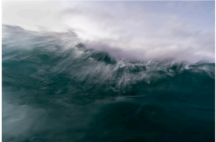
Wave Breaking, 2020 © Deb Achak