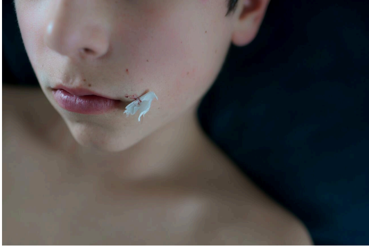
Shaving Practice, 2019 © Deb Achak