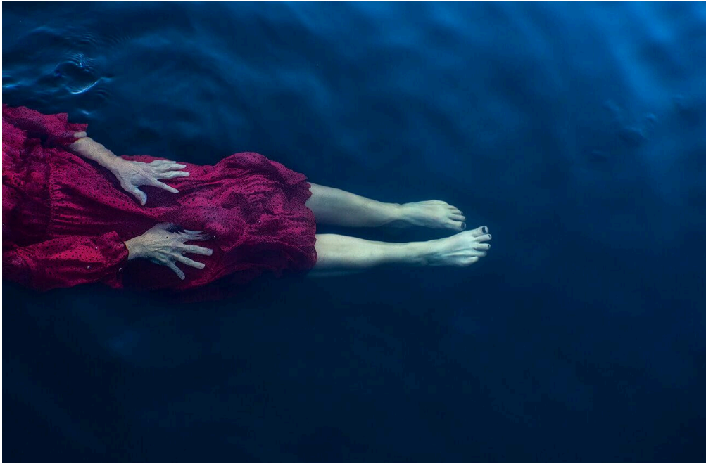
The Red Dress, 2019 © Deb Achak