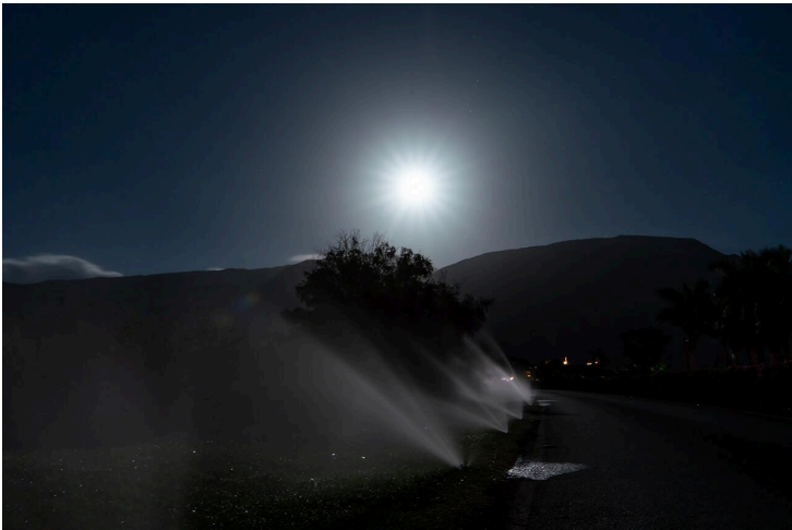
Sprinklers in the Moonlight, 2020 ©