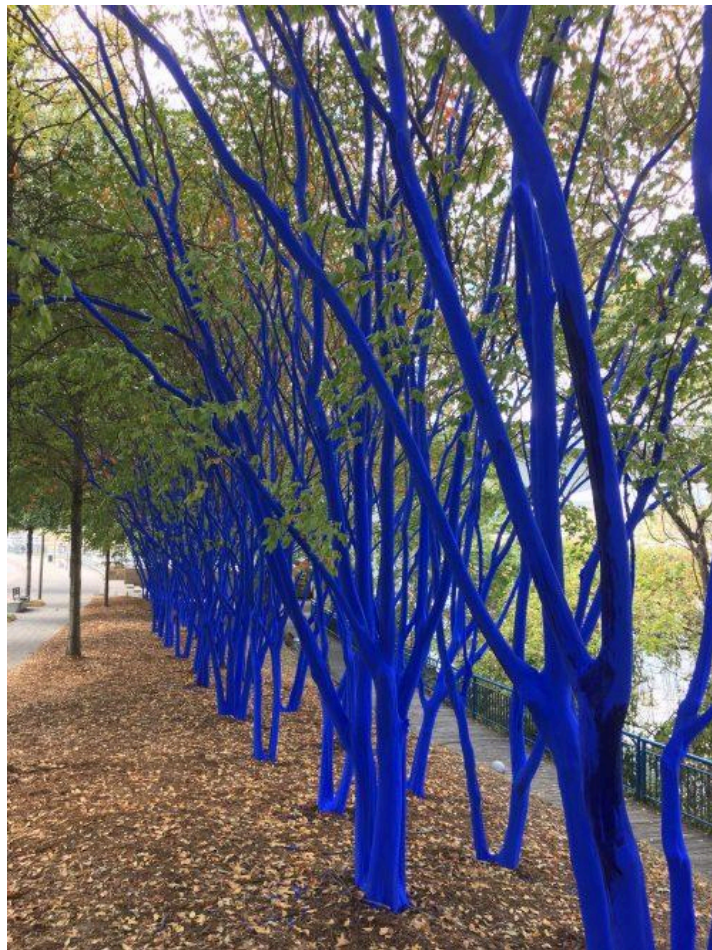
Konstantin Dimopoulos, "The Blue Trees." Installation view in Chattanooga, TN 2016.

SC: I can give you broad strokes. There's a lot that's happening now, but I feel that we're still at the beginning of it. There are things that are starting to work. The infrastructure is here. The mill buildings have these great loft spaces that are completely full with business and living spaces and studios... There are municipal and private groups that are working on different public art initiatives. There are also a lot of other things that help, like having new restaurants and new "third spaces," or places where you go to hang out that are not home or work.