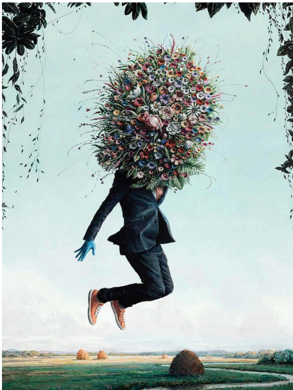
'Besotted by the Firth'

The characters in his paintings and graphite drawings often find themselves gleefully absorbed in nature, roaming and discovering the land while balancing on the absurd. Ethan Murrow draws on the faded pastoral idealism of America, rendering mountains, rivers, and forests as impossibly sublime wonderlands ready for exploration. His flower-headed canoers and adventurers trudge and trapeze through the landscape with an almost childlike determination.