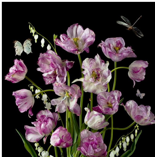
Purple Tulips, 2024

Winston Wächter Fine Art, New York is pleased to present Portraits in Bloom , a new series of photographs by Paulette Tavormina. In her second solo exhibition with the gallery, Tavormina takes inspiration from 17th-century Old Master still life paintings, transforming their rich symbolism into contemporary photographic portraits of flowers.